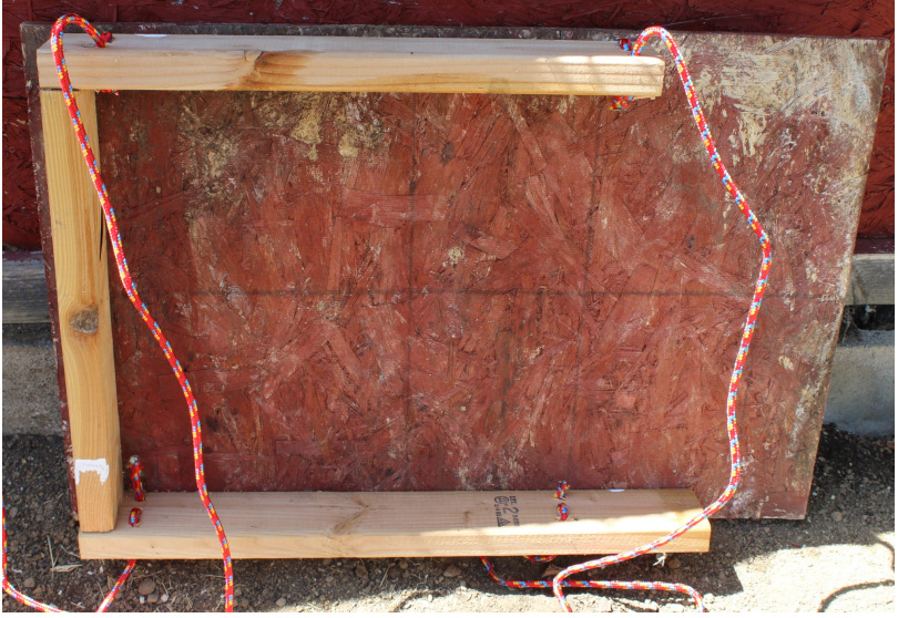
Hand-made Slope Boat to Carry Skirts & Stems Sliding from Top of the Slope down to Bottom by Two People