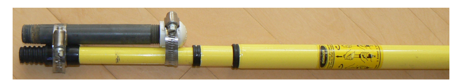
Rebar Pipe Socket at Front Edge of Extendable Rods