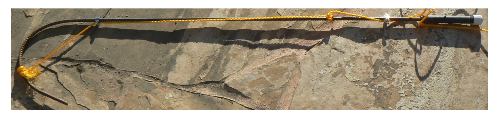
Hand-made Branch Puller (Hook Rounded Rebar to Branch, then, Pull Rope down)