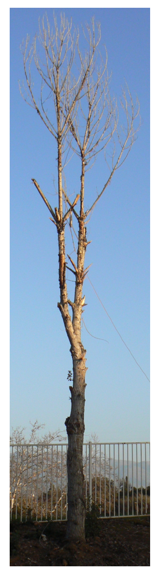
Branches Thinned by Hand-made Branch Puller