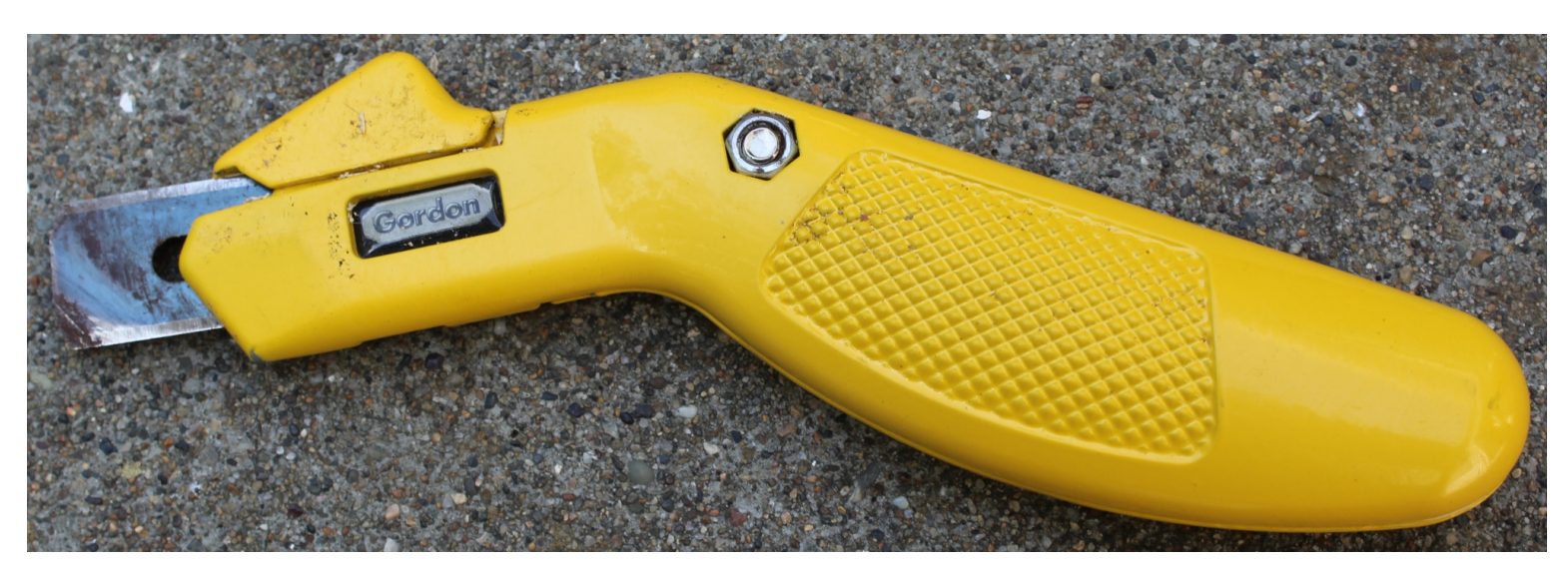
Carpet Knife to Chop off Palm Tree Skirts

Palm tree naturally seeded and grew near iron fence became so big and started pushing the fence outward.