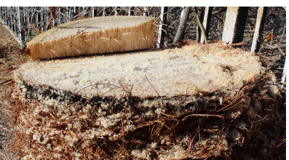
Face Notch Mark on Base Stump