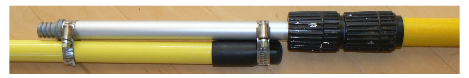
Connection between Two Extendable Rods using Hose Clamps