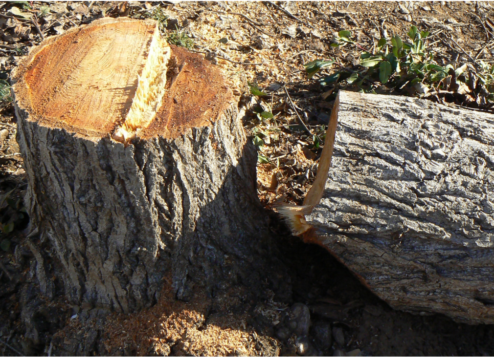
Fell down (around Base Stump with Face Notch Mark)