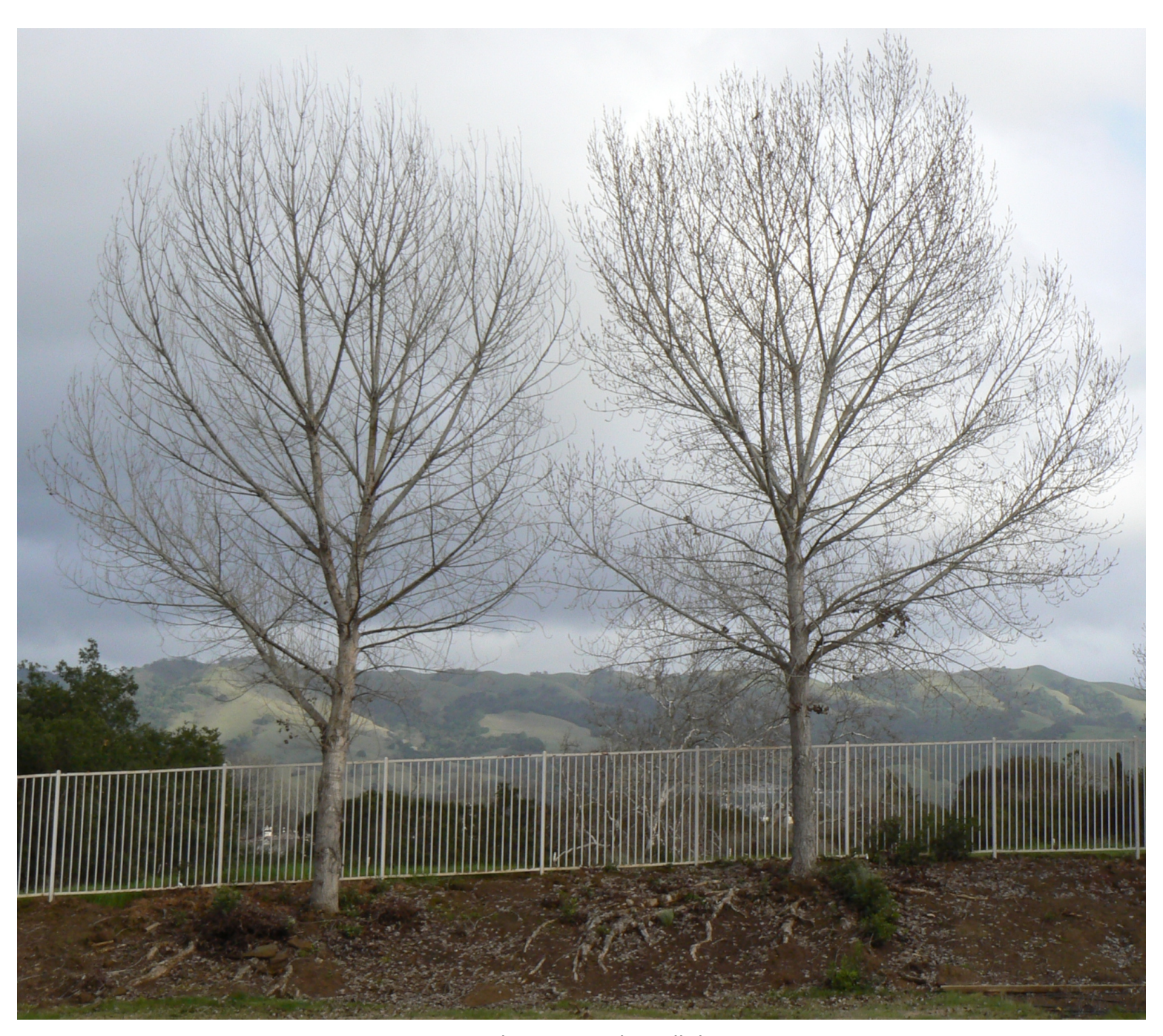
Two Poplar Trees to be Fell down

Poplar was planted too close to lawn that needs wet condition. Therefore, the powerful roots which has mutant behavior combining roots into one together invades under the lawn and break irrigation pipe further more. Poplar tree removal was a must.