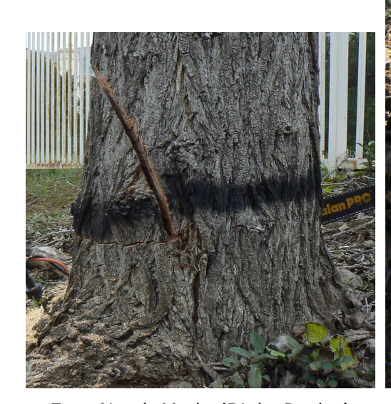
Face Notch Made (Right Poplar)