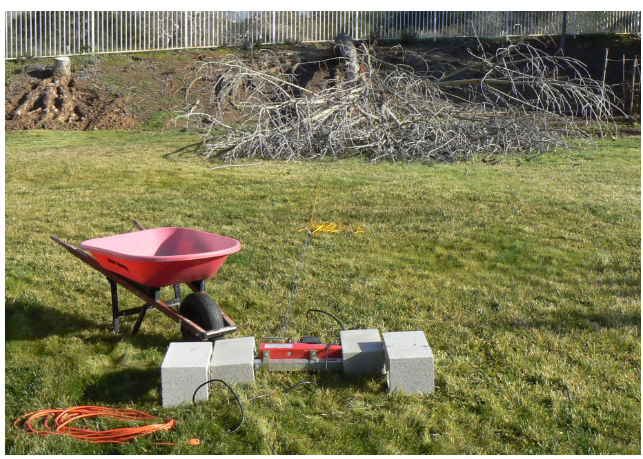
Pulling Rope by Winch (Right Poplar)