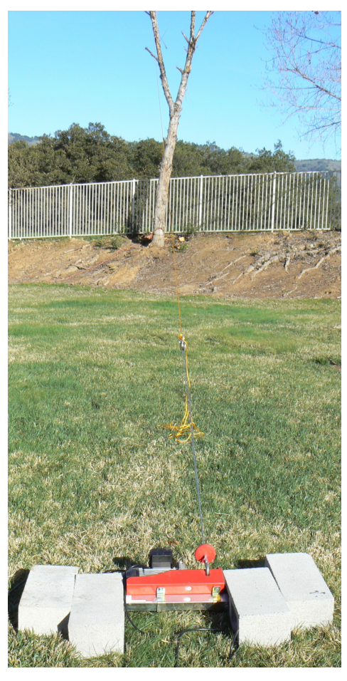
Pulling Rope by Winch