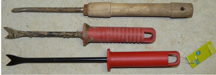
Metal Weed Sticker Portion Worn off (Up Most)

Front edge of weed sticker wore off by frequent sticks to the ground for weed removal. The metal portion was replaced by relatively new weed sticker with somewhat short red handle keeping longer wood handle.