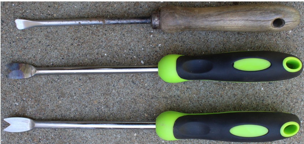
Third generation sticker