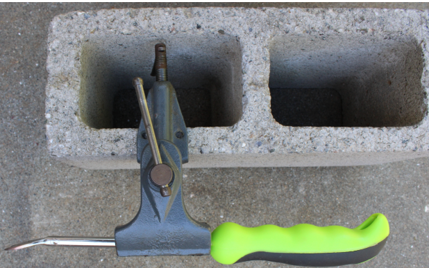
Sticker is ready for grinding fixed by vice

However, new sticker looks sturdy but the fork end was too thick to stick. It made too much resistance. I made it sharp by using a metal grinder below.