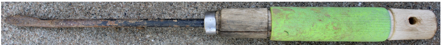
The fork end was completely wore off around 5 years later.