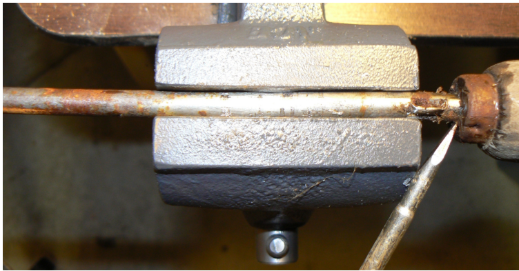
Removing Metal Weed Sticker Portion Fixing by Vise