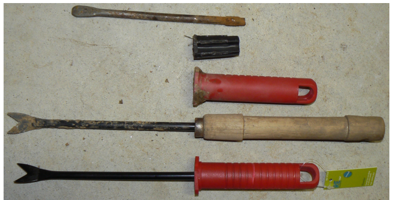
Done (Upper 3 Pieces Thrown out)