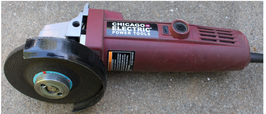
Grinder with a metal grinding wheel

Continuous multiple time sticking for a long time wore off even fork end made by iron! Don't settle. Stick with it forever.