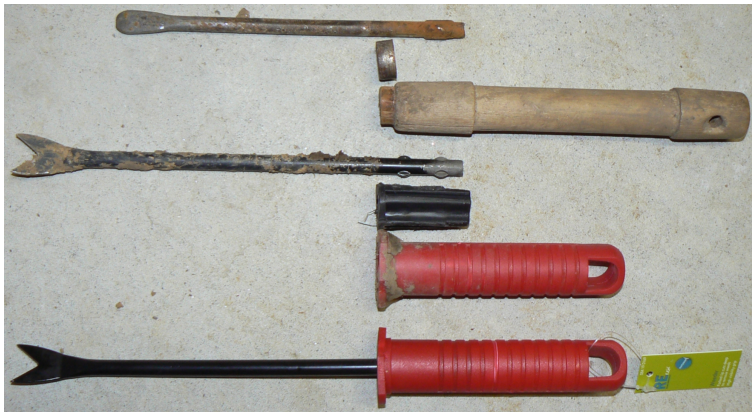
Ring, Wood Handle & Metal Sticker to be Built