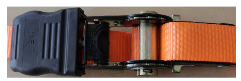
Step 11 Pulling out...