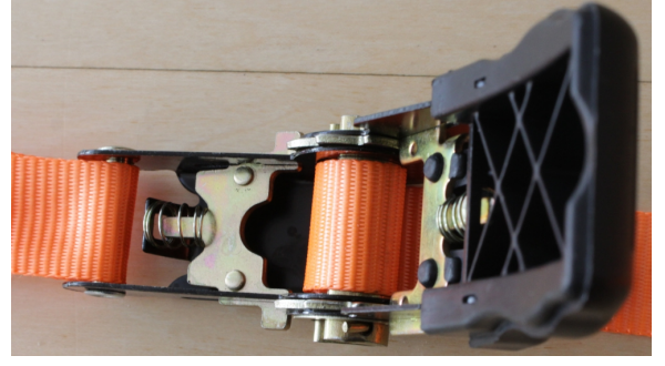
Step 6 Open ratchet until stop to wind strap