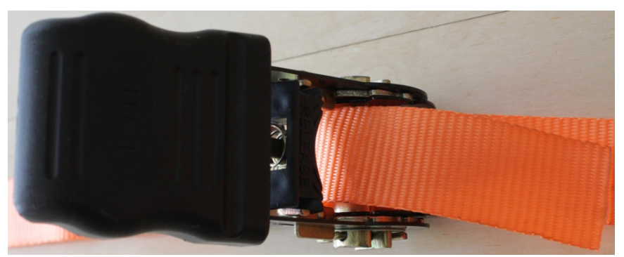
Step 3 Fold back strap over (Ratchet outside view)