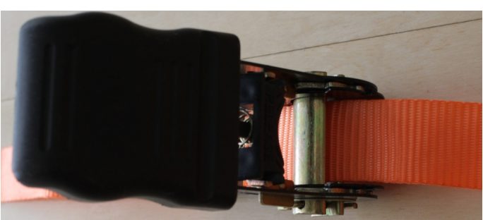
Step 2 Pass strap through the through-hole