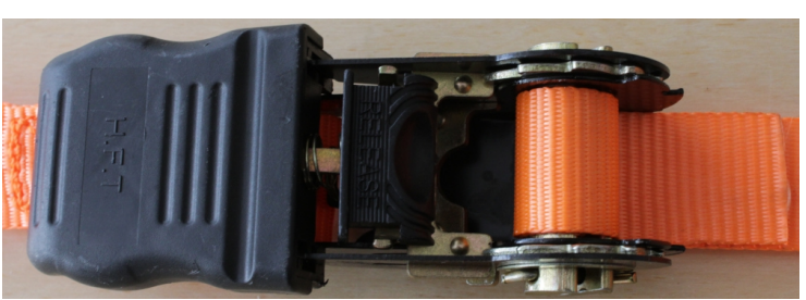
Step 8 Stop winding (Lock straps not to slip)