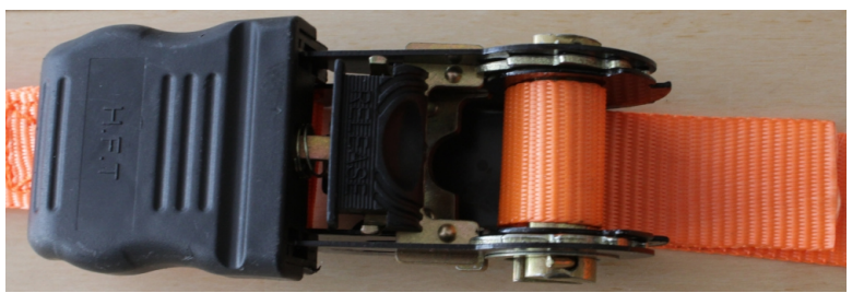
Step 7 Fold ratchet, Winding (Repeat Step 6 & 7)...