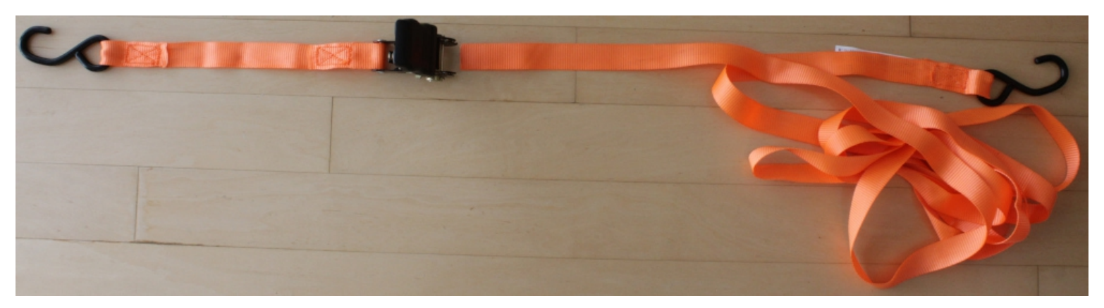
Whole aspect (Two hooks, ratchet, two straps)