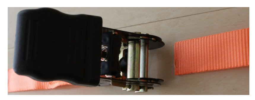
Step 1 Bend ratchet 90 degrees to expose through-hole