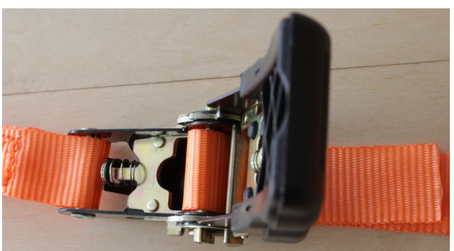
Step 4 Fold back strap over (Ratchet inside view)