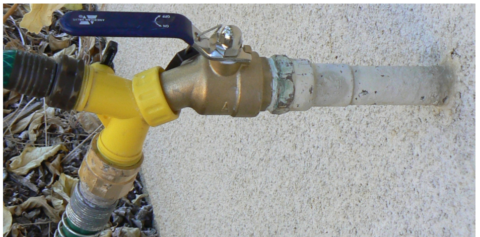
Replaced to Quarter Turn Hose Bibb