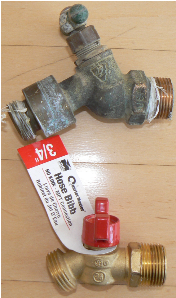
Replacing Hose Bibb