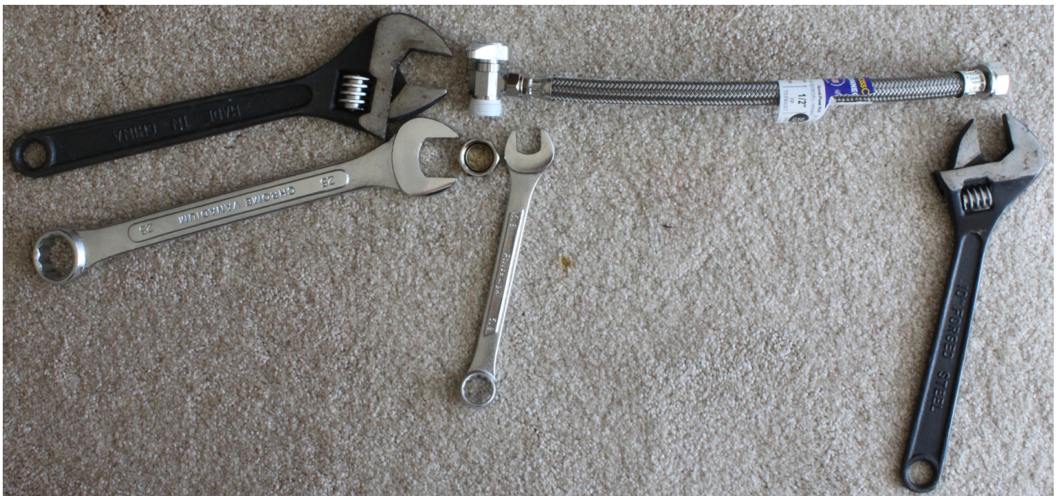
Two Adjustable Wrenches & Two Wrenches for Consecutive Hose & Valve Replacement