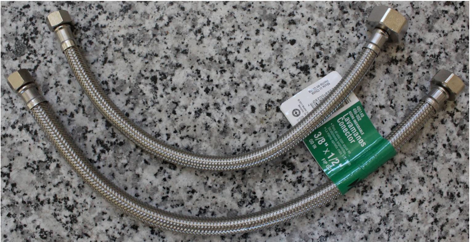
1/2" x 7/8" Toilet Hose (Up) & 1/2" x 3/8" Faucet Hose (Down)