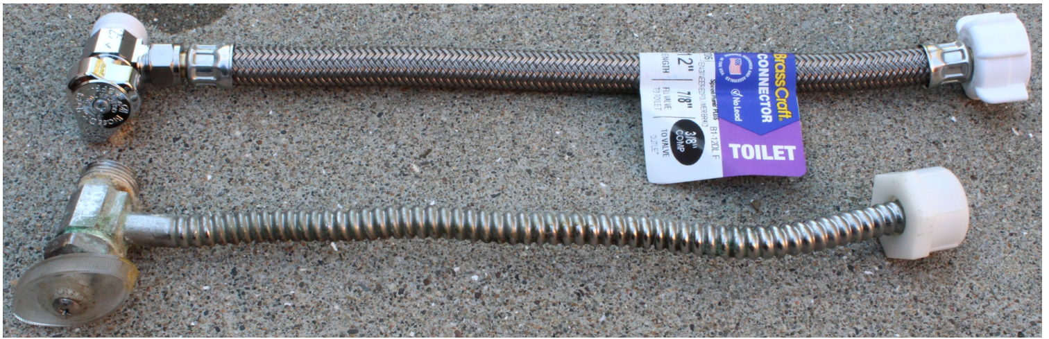
Toilet Hose (New with Quarter Turn Angle Valve (Up), Old with Multiple Turn Angle Valve (Down))