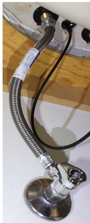
Replaced by New Quarter Turn Angle Valve with Hose