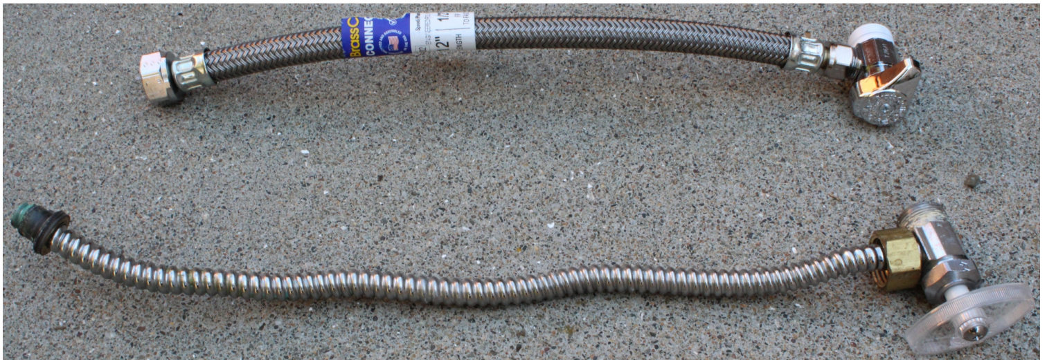
Faucet Hose (New with Quarter Turn Angle Valve (Up), Old with Multiple Turn Angle Valve (Down))