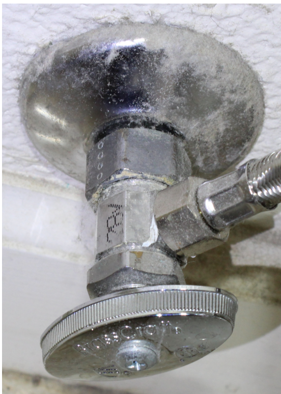
Multiple Turn Angle Valve