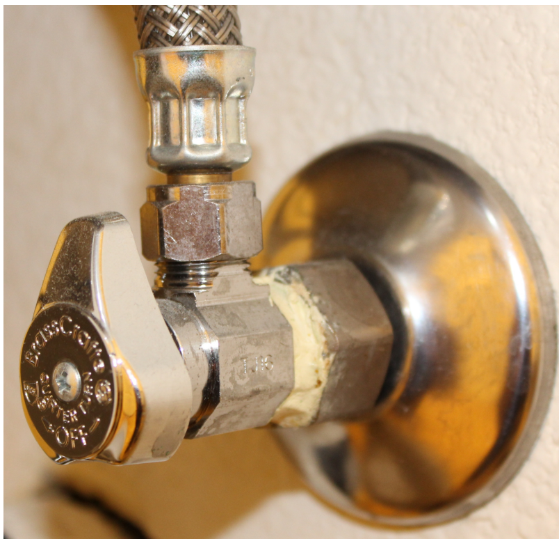
Quarter Turn Angle Valve