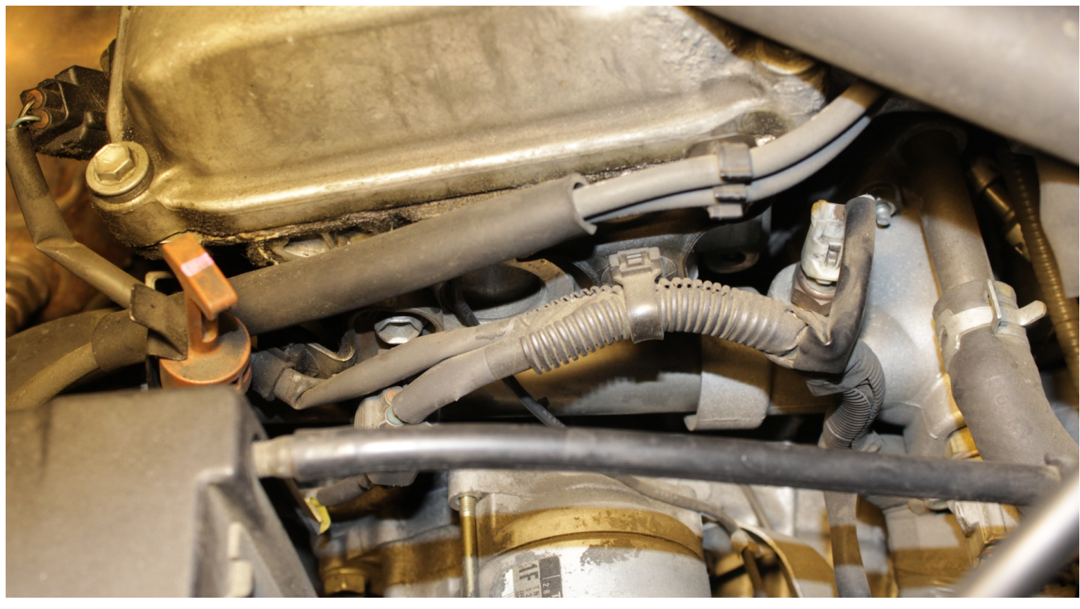
Draining coolant from engine room and heater core