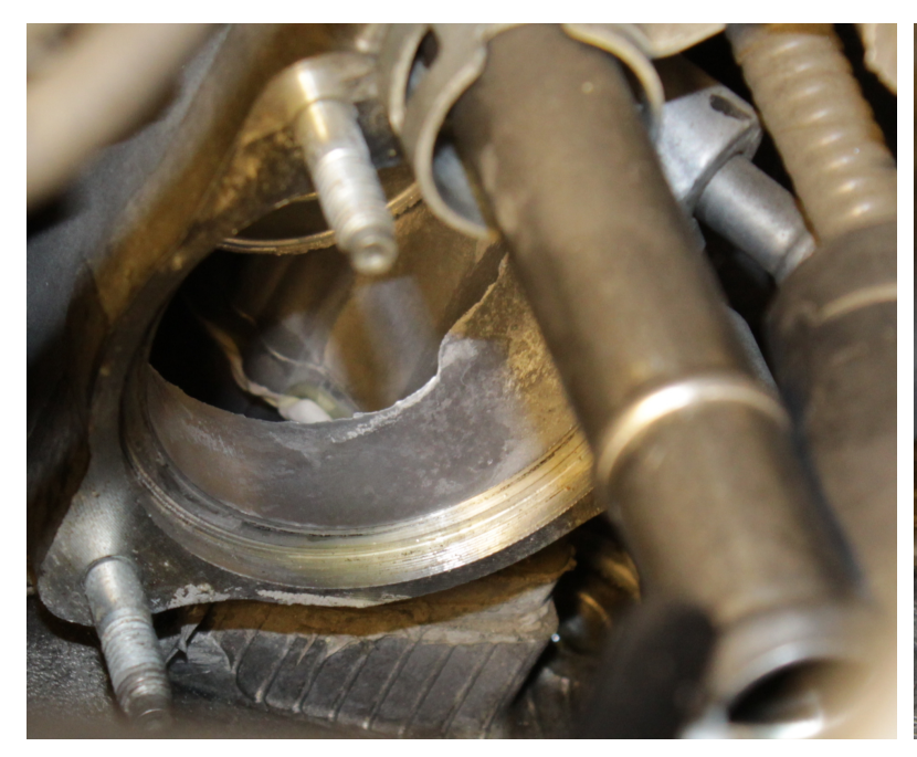
Before attaching new coolant thermostat (Inside engine compartment)