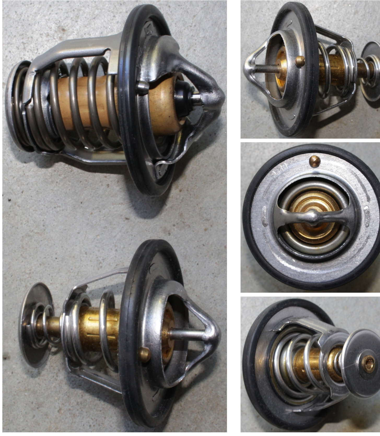
Coolant thermostat (Up; Old, Down; New)