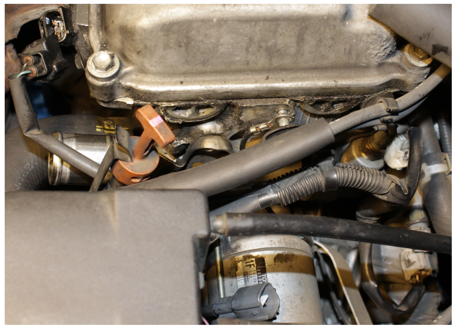
Detached four electrical connectors, radiator upstream rubber hose, and clamps