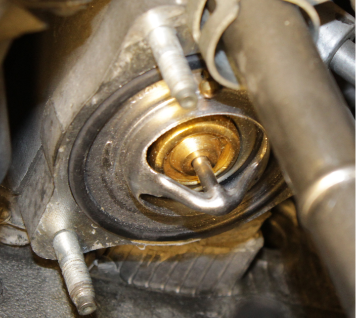
New coolant thermostat attached