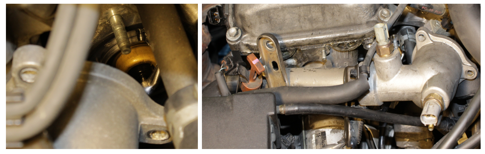
Old coolant thermostat appeared