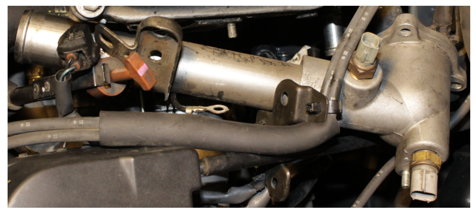
About to be removed...