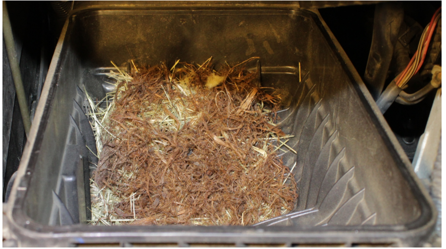
Wow! Bird nest in there!