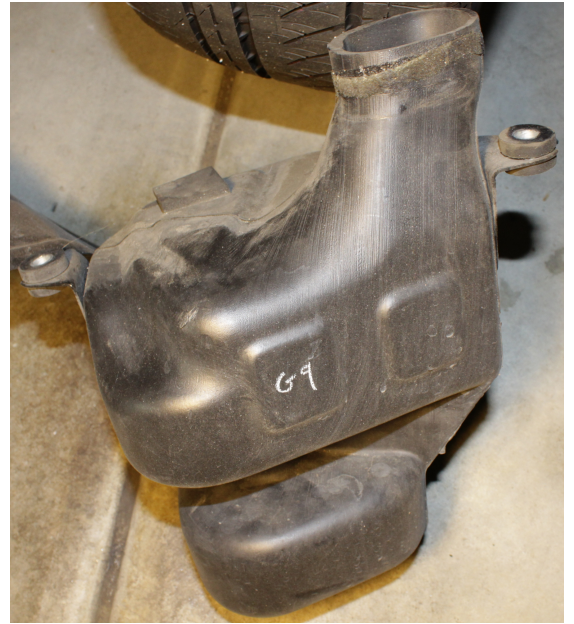
Lower Air Duct