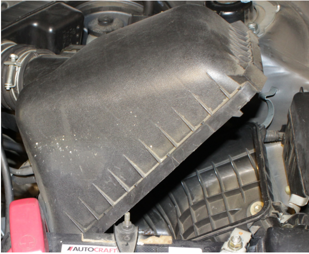
Opening air filter box

I found that the plastic air duct connected to the air filter box is divided into two portions and the large air intake is just opened with no mesh screen. What a low-tech!