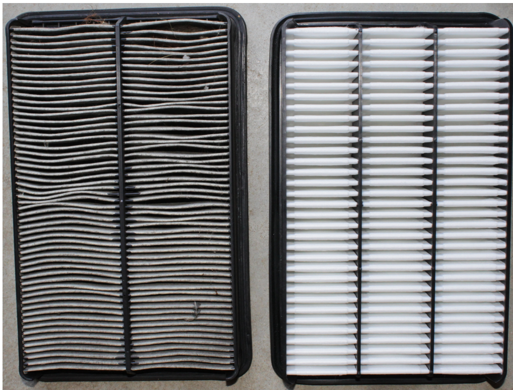
Old (Left) & New Air Filter (Right)