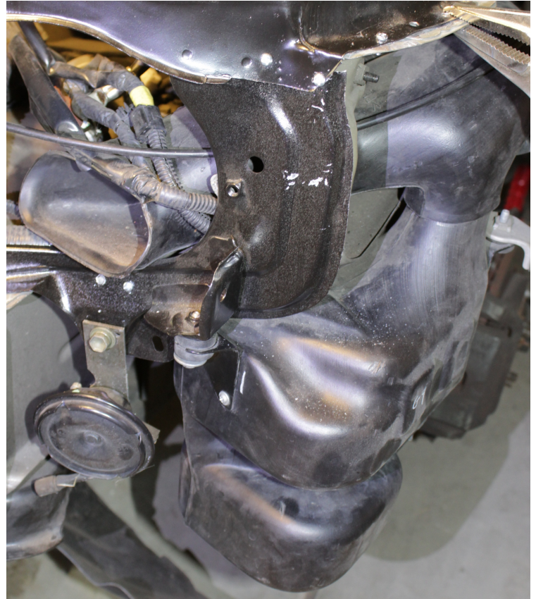
Air Duct Assembled (No mesh screen at opening)