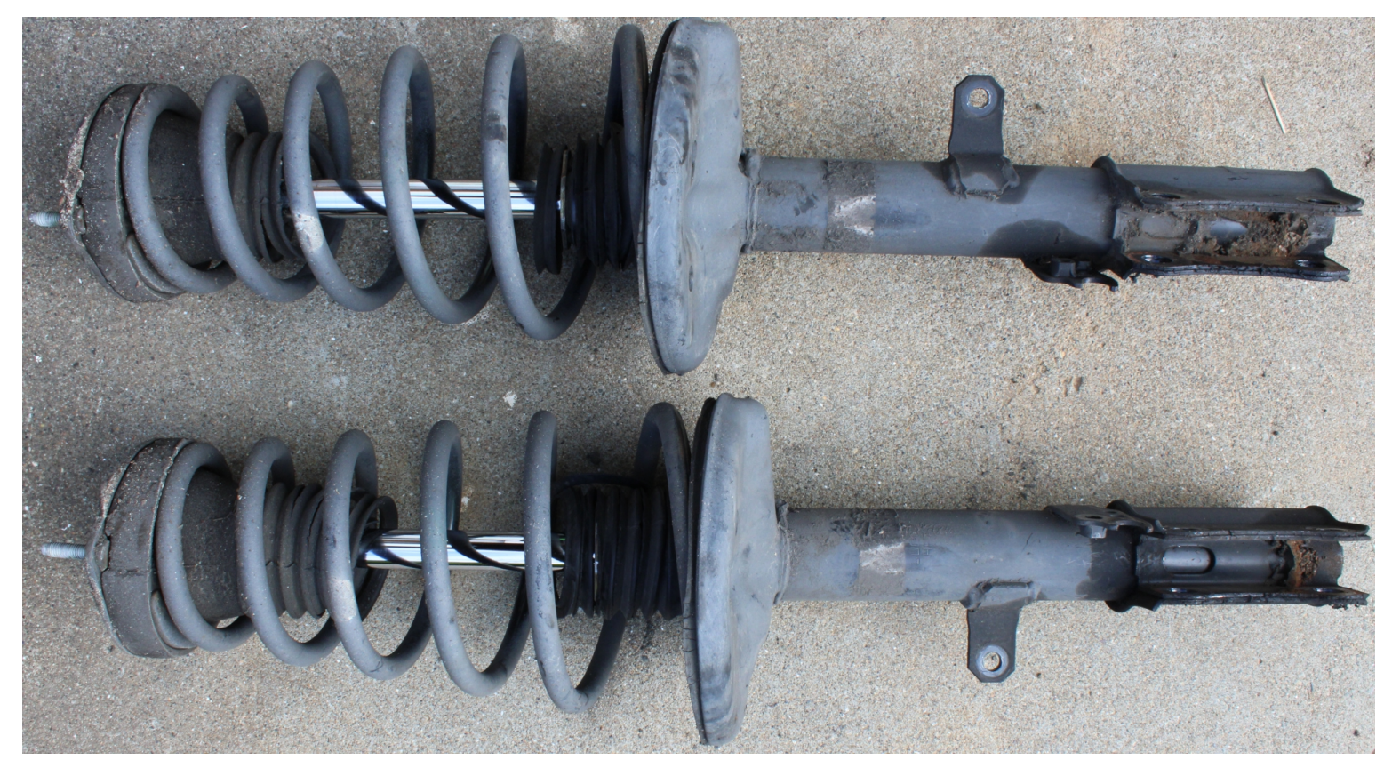
Old strut assemblies (rear right (upper) & rear left (lower); Tab position differs) removed