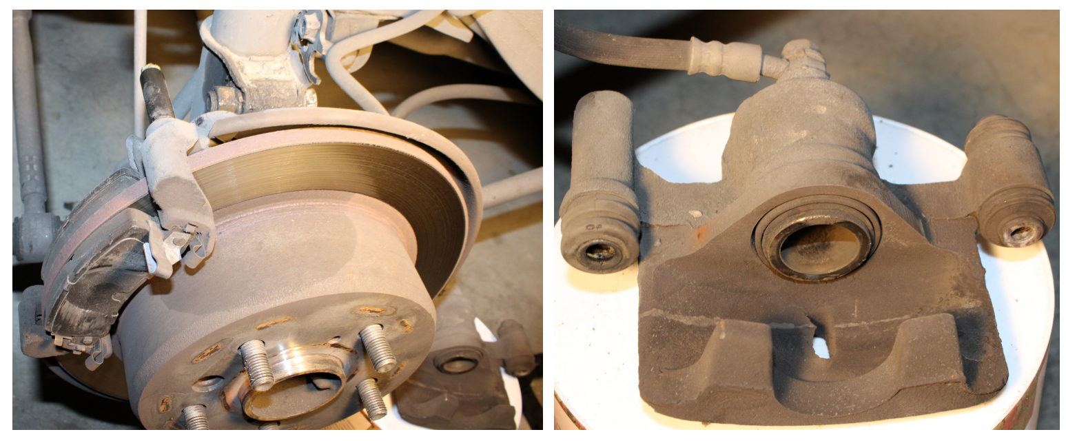
Brake caliper had to be detached to get enough room

Brown plastic trim removed, top strut assembly nuts exposed supporting a board by a 2x4 lumber (lower right)