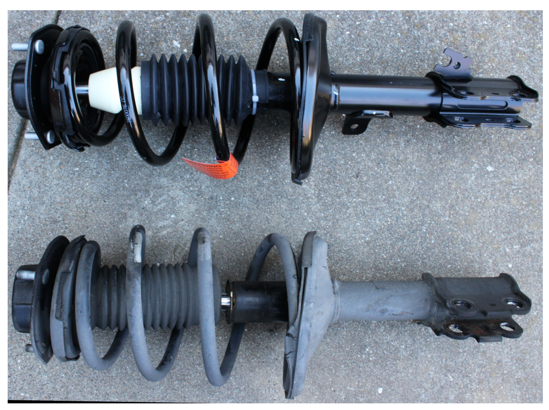
Front strut assembly New (upper) & Old (lower) Coil spring 3.5 turns (Front strut assembly) instead of 5.5 turns (Rear strut assembly)