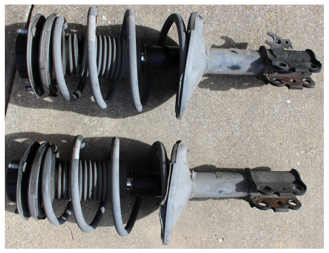
Old strut assemblies (front right (upper) & front left (lower); Tab position differs) removed