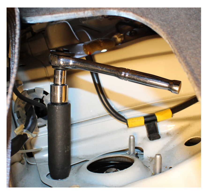
Using 1/4'' small ratchet with 1/4'' to 3/8'' to 1/2'' adapters