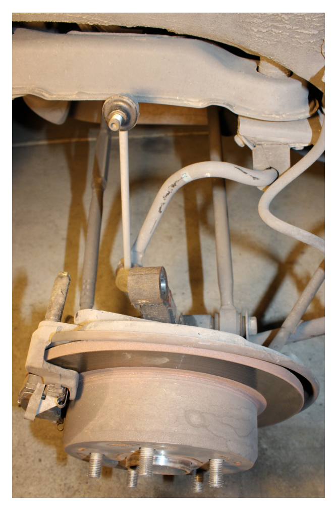
Old strut assembly removed