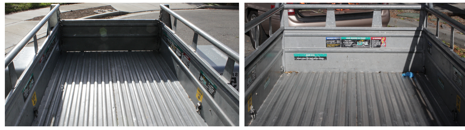
Hook positions on loading space