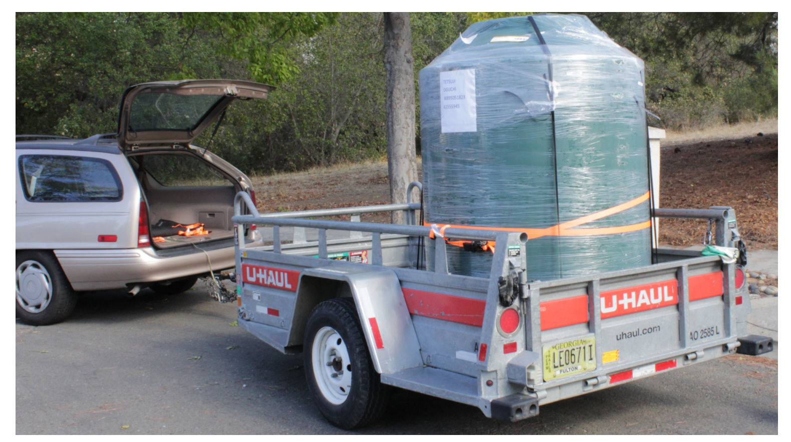
Uhaul 5' x 9' Utility Trailer loading a 300 gallon rain water tank