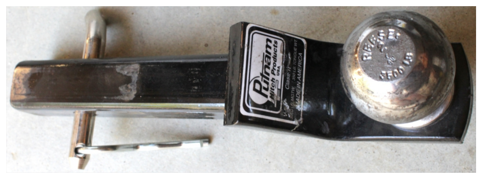
Trailer hitch with 2" hitch ball and attachments