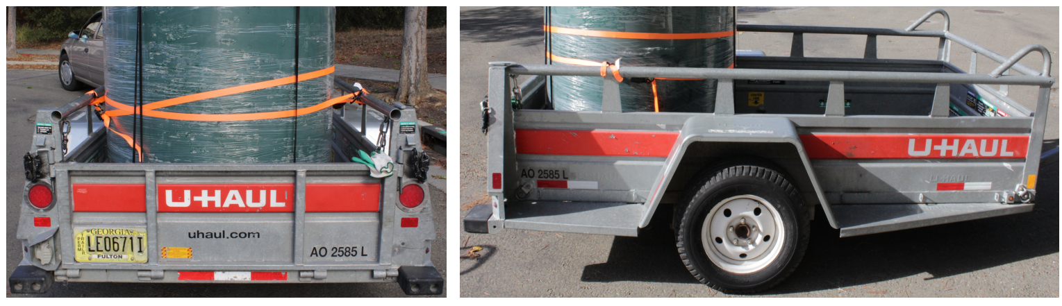
Rear (2 door latches)