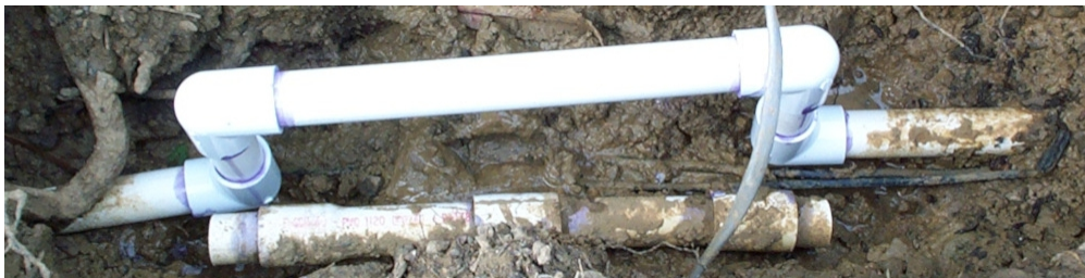
Repaired (Applied by All-around PVC Pipe Repair Method; Two Pipes are not Straight (Curved))

Gardener's PVC routing skill level looks so low because water leak at many places were observed. The reasons obtained as a result of my repair works are;