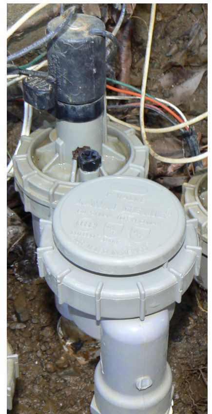
Cap Assembly Replaced

Shield cap assembly is for back flow protection. The quality was insufficient and cracked at the weakest portion. In my long term piping experience, 1" "Orbit" Anti-siphon Valve is better than "Lawn Genie (Example above)".