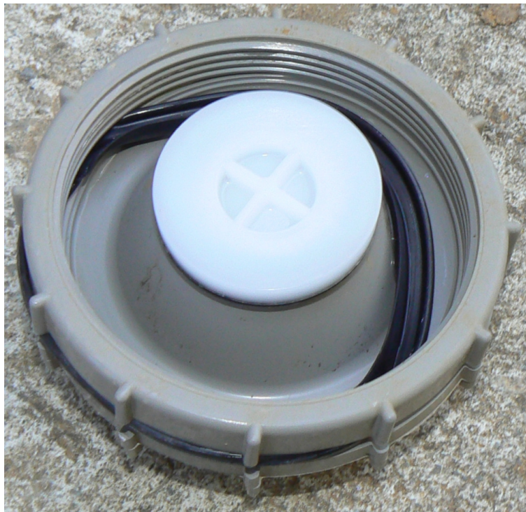
Cracked Shield Cap Assembly