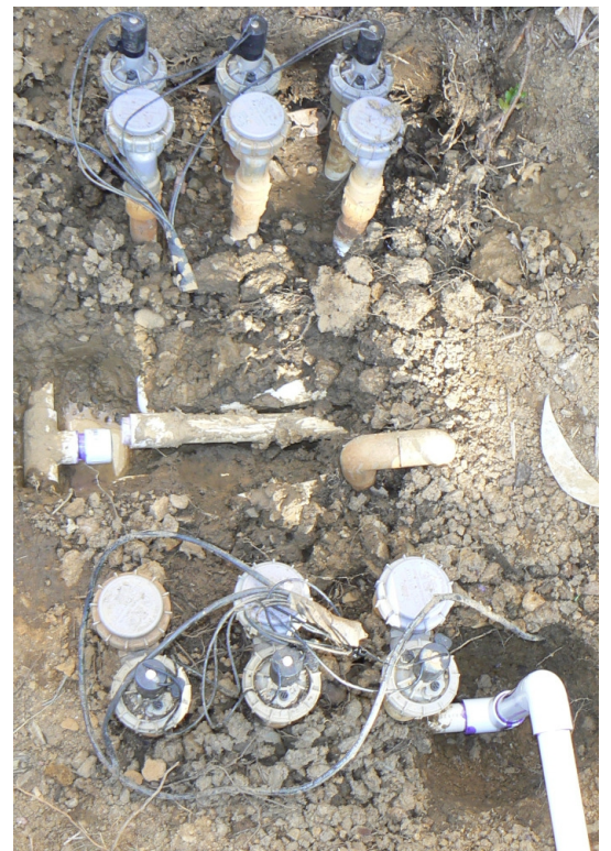
Sprinkler Main Pipe Rerouted to Valves

PVC pipes are stacked together with rain water drain pipe as well as connected under curving together. This is a gardener's symbolized sloppy work that incurred water leak everywhere.