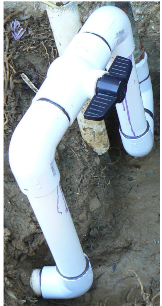
Repaired Putting External Water Main Valve