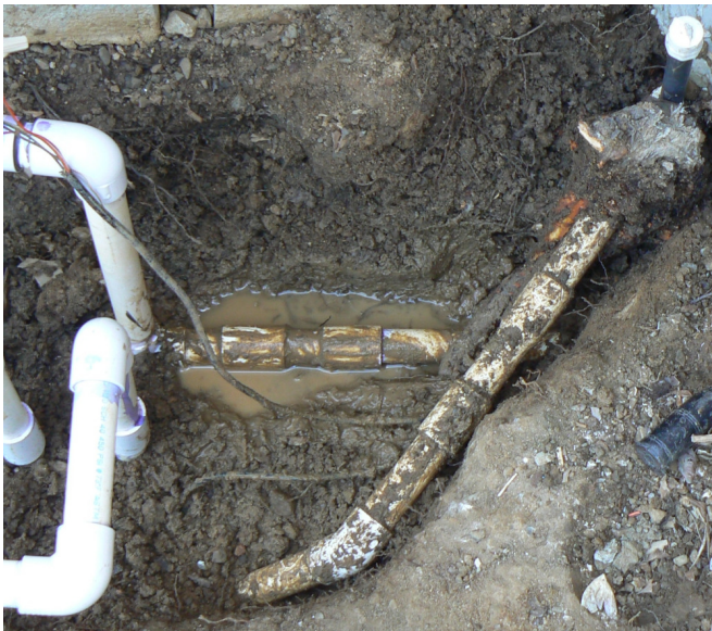
Leaking Sprinkler Main Pipe