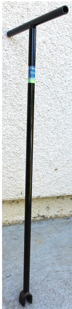
28" Curb Key