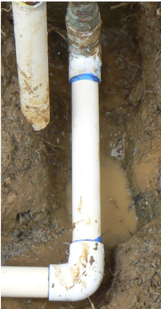
Utility Water Main Pipe Leaking