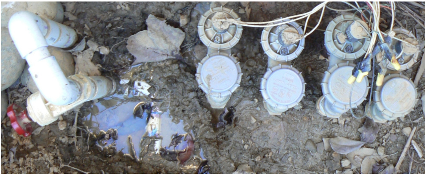
Leaking Sprinkler Main Pipe (Newly Attached Sprinkler Main Valve (Red; Left))