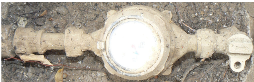
Utility Water Main Valve (Stop Water Flowing (Close) Position)