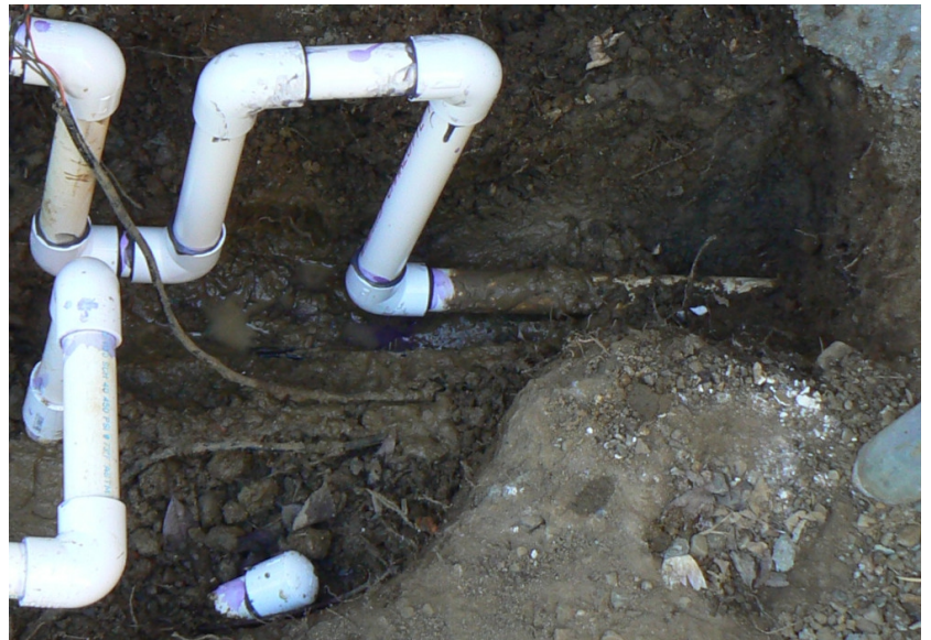
Repaired & Removed Broken Pipe by Tree Root

So many water leaks happened on sprinkler main pipe found. It is so bad because water leaks all the time unlike water leak on PVC pipes connected after sprinkler valve.