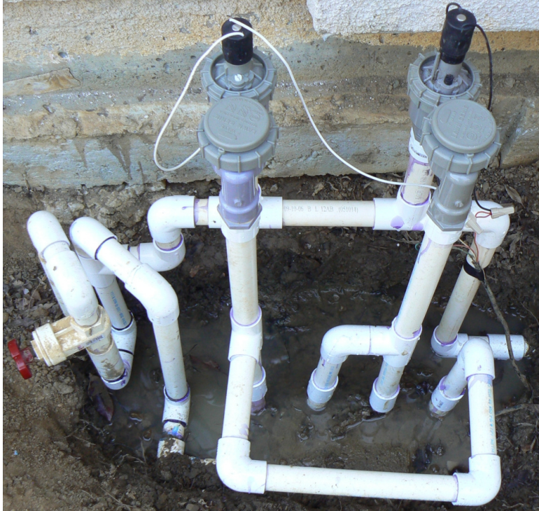
Reduced Number of Valves (Sprinkler Zones)