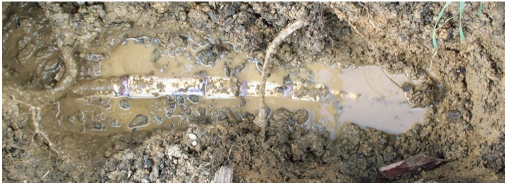
Leaking (Due to Undesired Connection at Curving (not Straight) Overstretched Pipes)