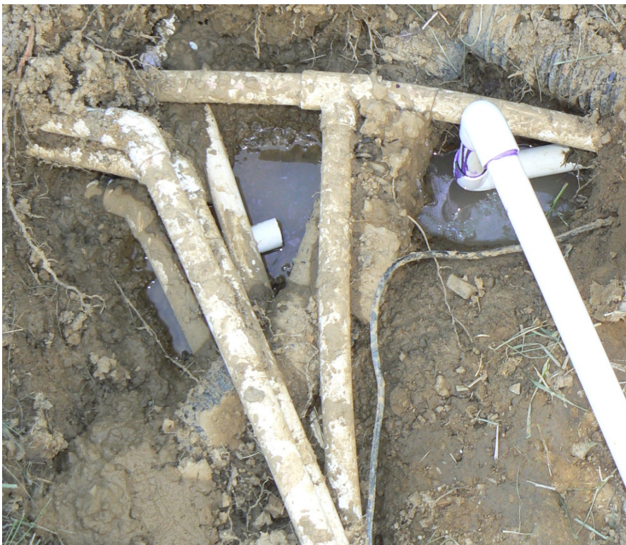
Cut & Rerouted