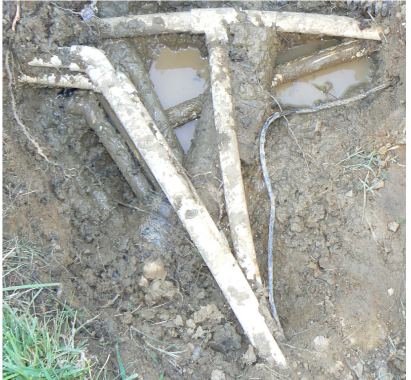
Leaking Sprinkler Main Pipe (Lowest Layer)