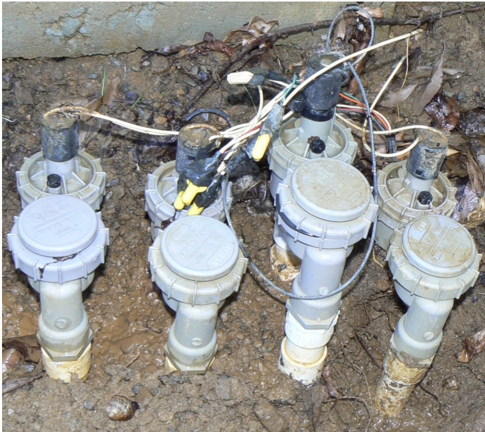
Shield Cap Assembly Cracked (Elastic Seal Exposed)