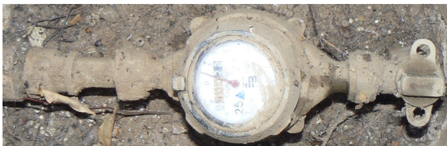
Utility Water Main Valve (Water Flowing (Open) Position)

This 1 1/4" PVC piping for utility water main pipe was done by gardener who did not have sufficient skill of PVC piping. This is ultimate evidence of my judgement for the gardener's work. Give me a break!