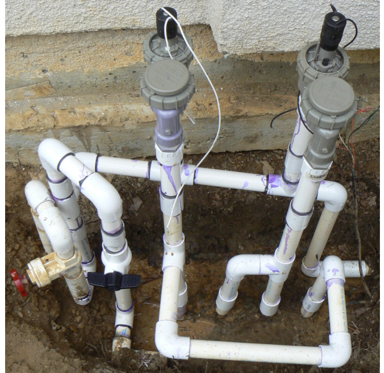
Newly Attached Zone Main Valve (Black)