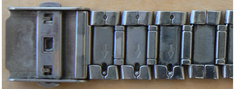
After (3 Metal Section Blocks with Arrow)