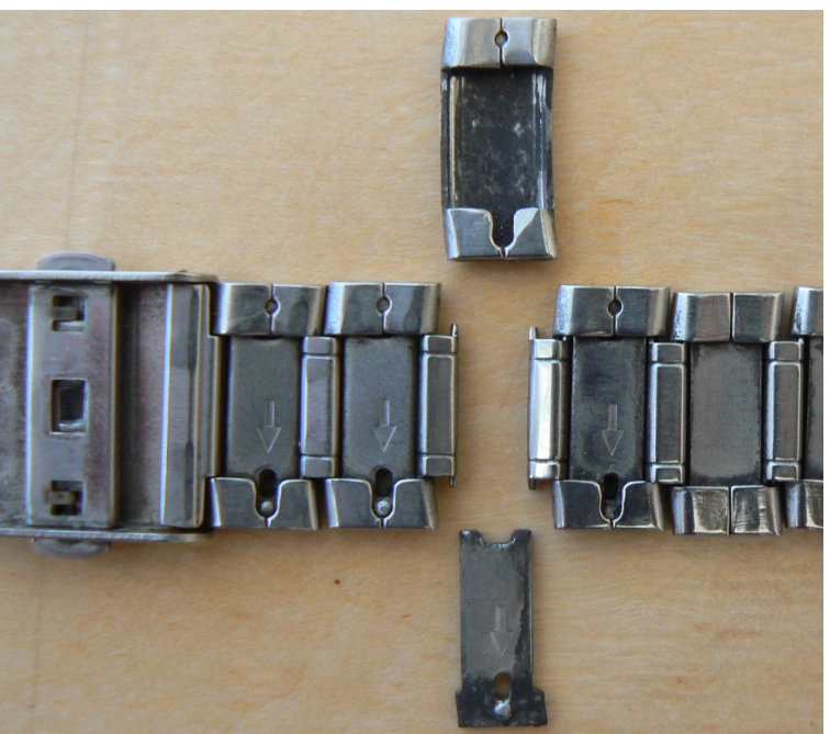
Removing Metal Section Block