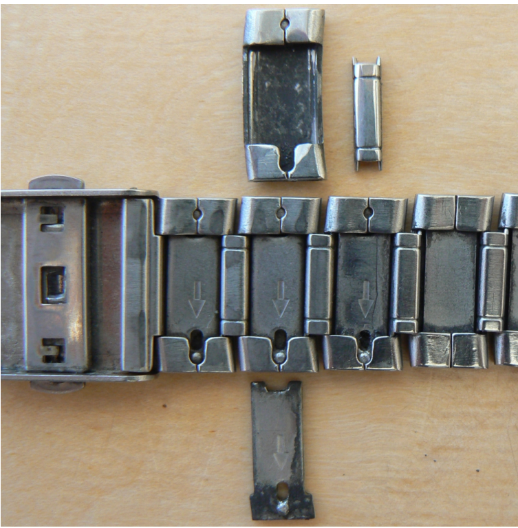
Done (3 Pieces to be Disposed)