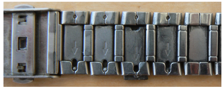
Before (4 Metal Section Blocks with Arrow)