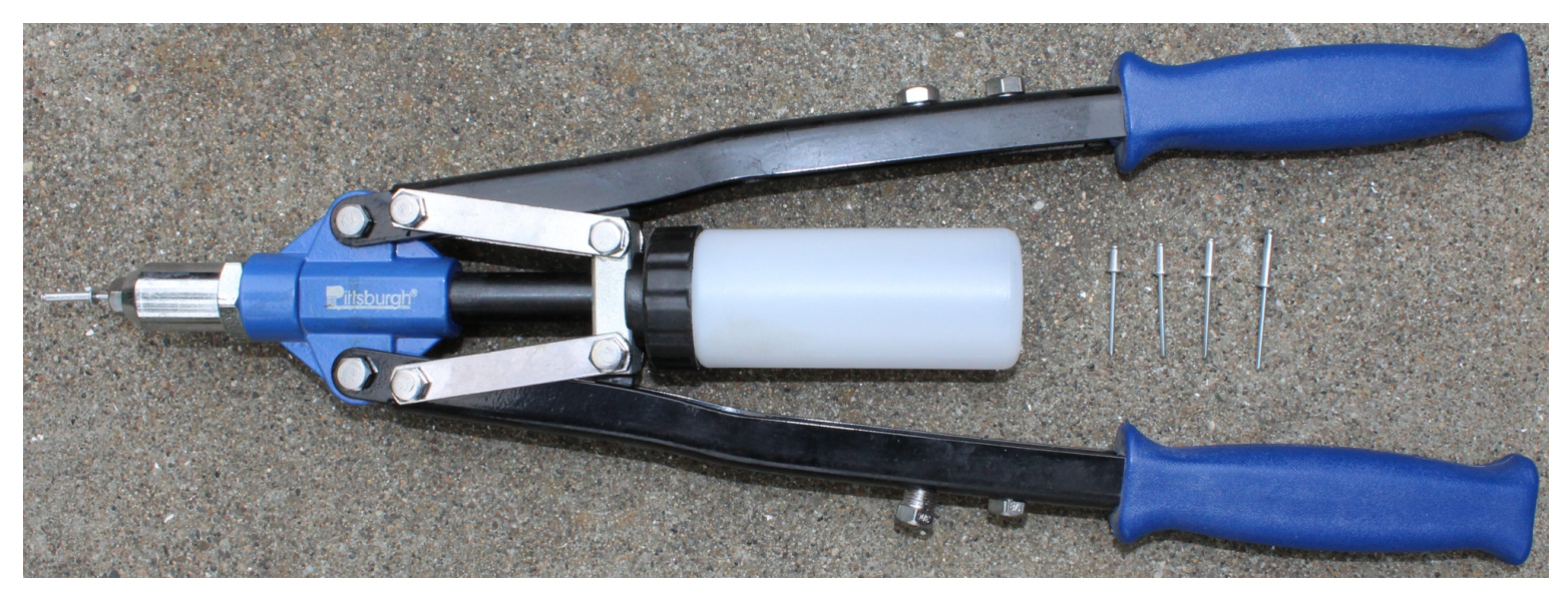
Riveter & Rivets (1/8" x 1/4", 1/8" x 5/16", 1/8" x 3/8", 1/8" x 5/8")

I put a keyed guard board using standard USPS mailbox. I adopted using rivets, not using bolts & nuts that can be easily disassembled.