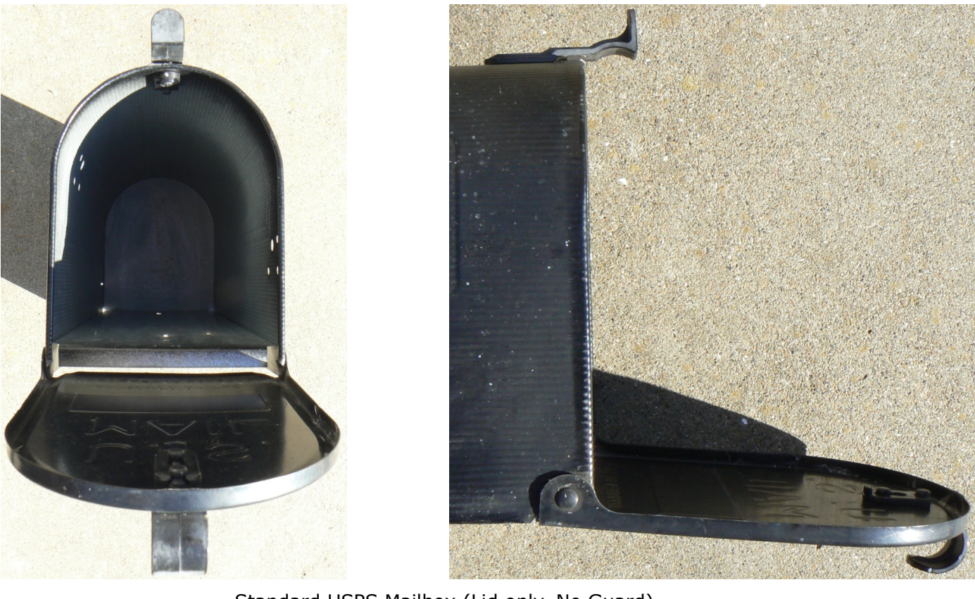
Standard USPS Mailbox (Lid only, No Guard)