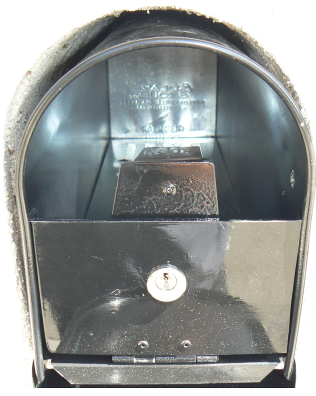
Opening with Slope