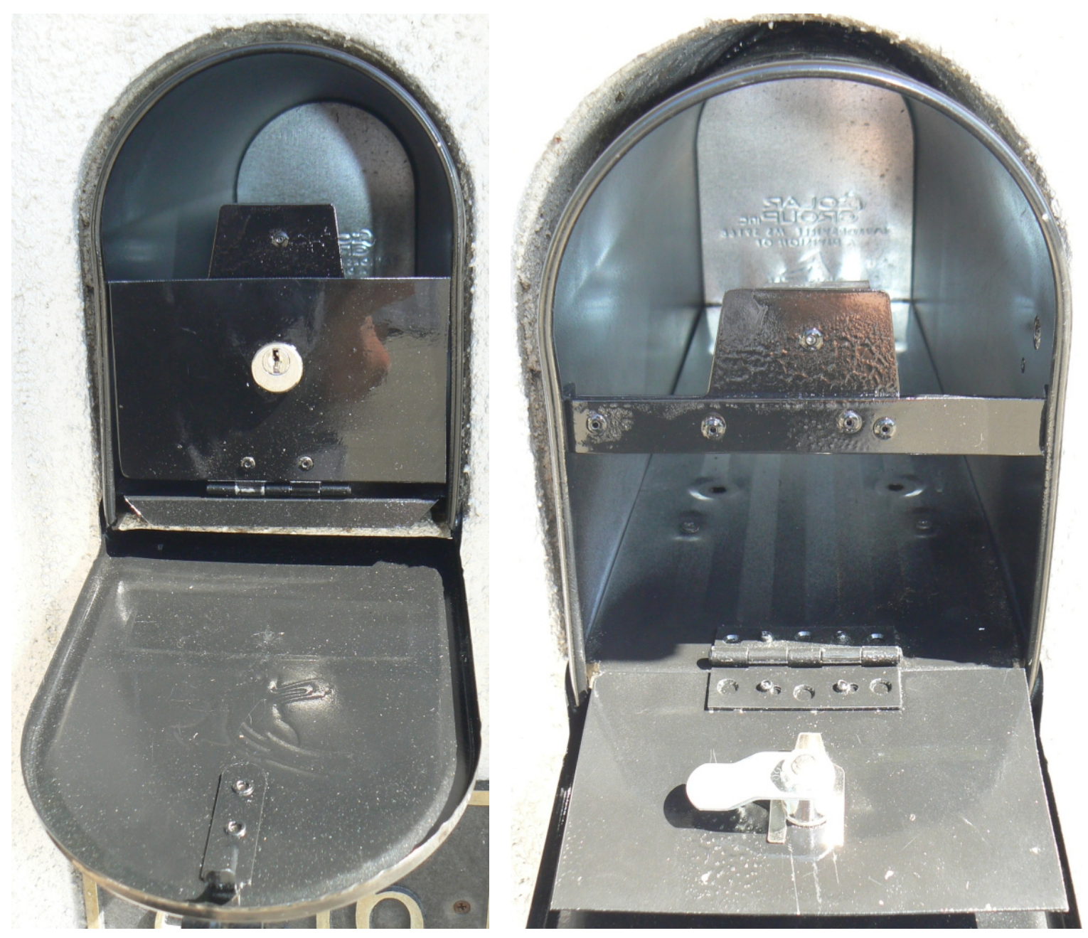
Done (Lid Opened)