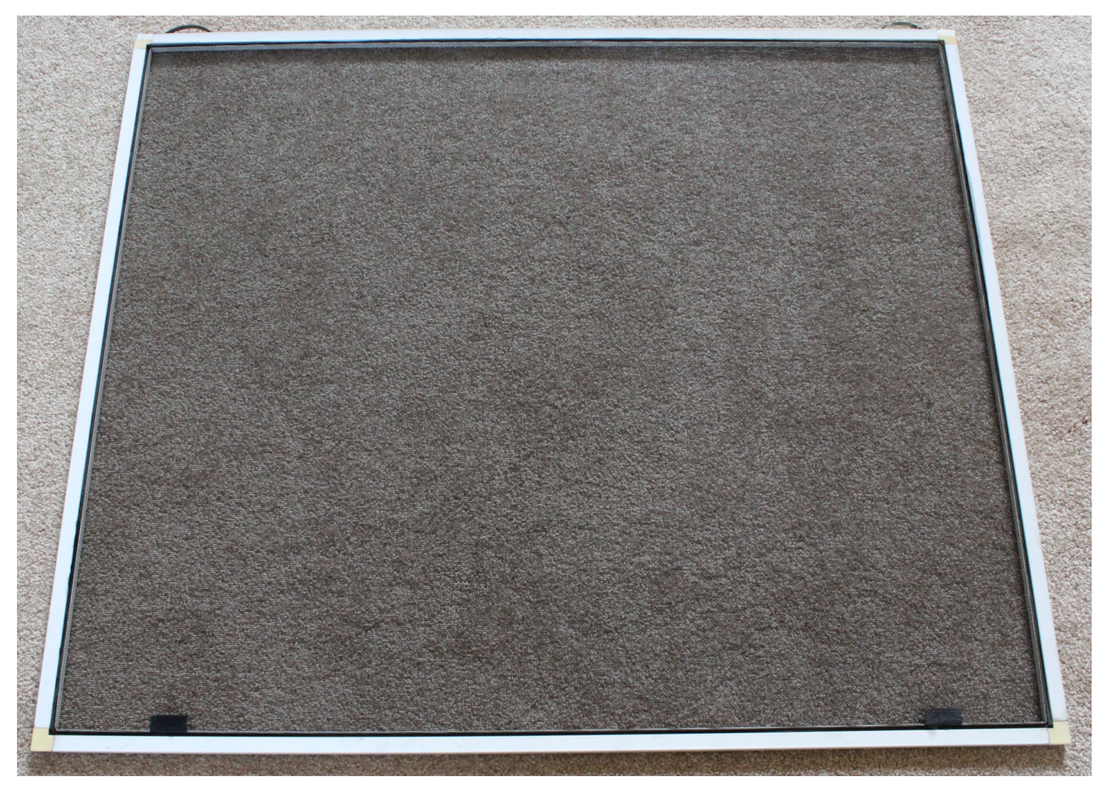
Done (Screen Tension Looks Good, Extra Spline Needs to be Cut)