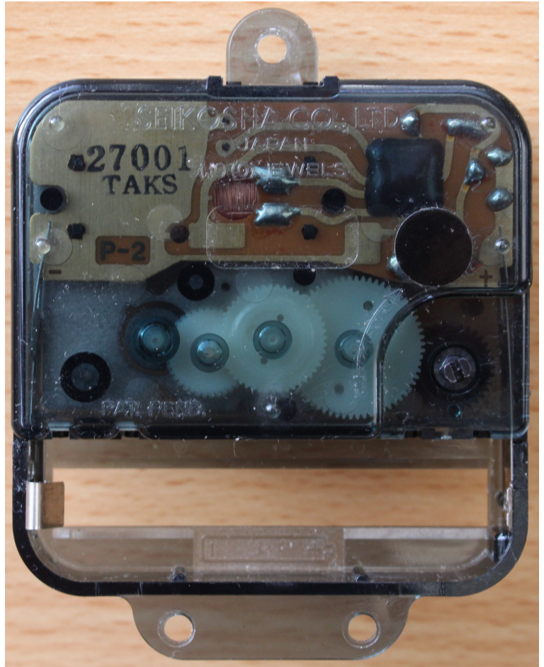
Original clock core (Rear) to be replaced

Original clock core was ticking but often stopped ( watch MP4 video ).