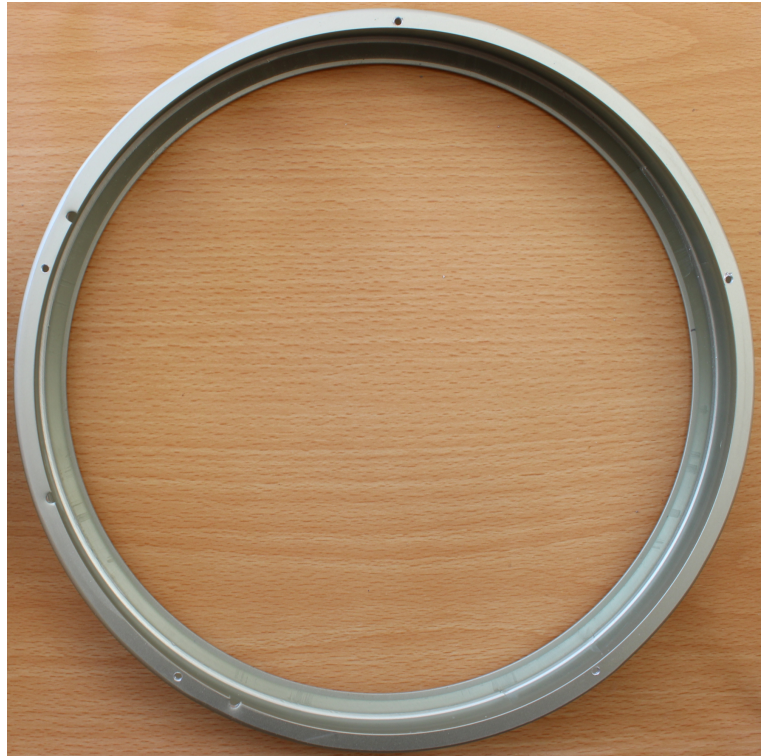
Original frame (Rear)