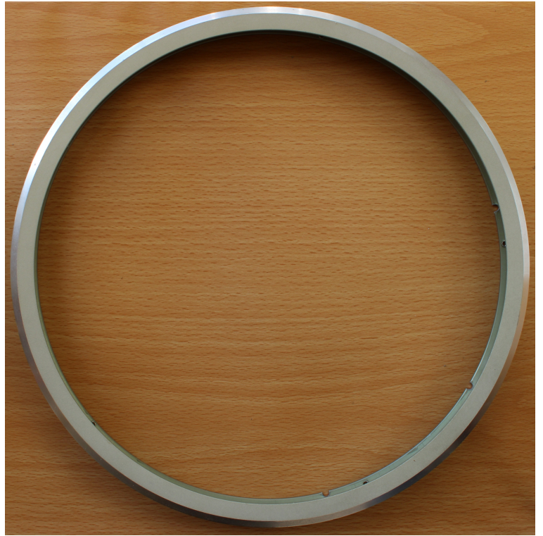
Original frame (Front)