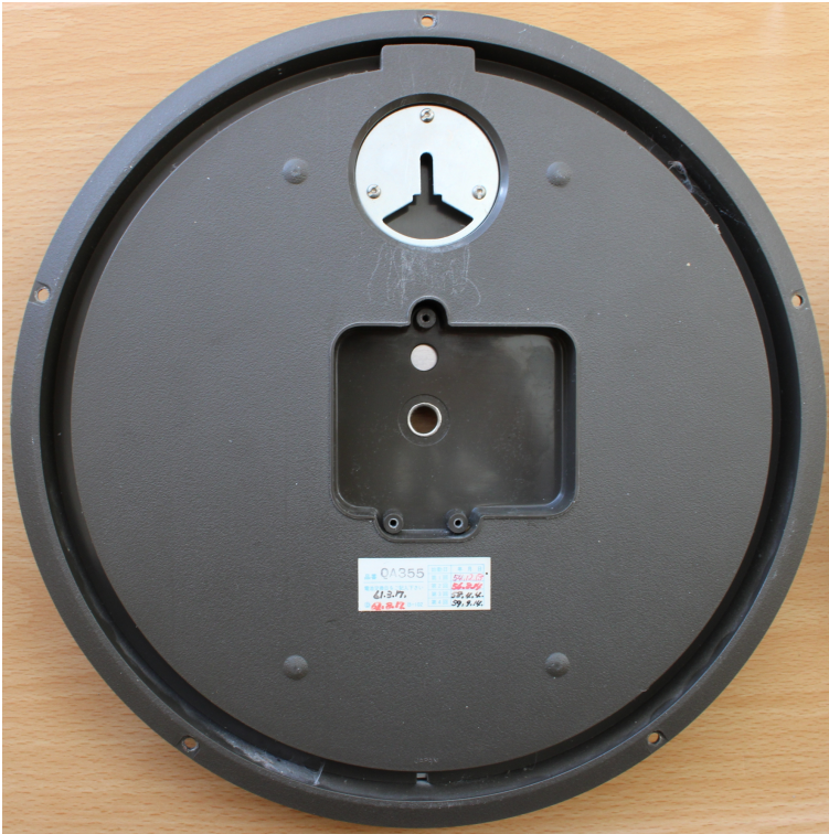
Original dial plate (Rear)