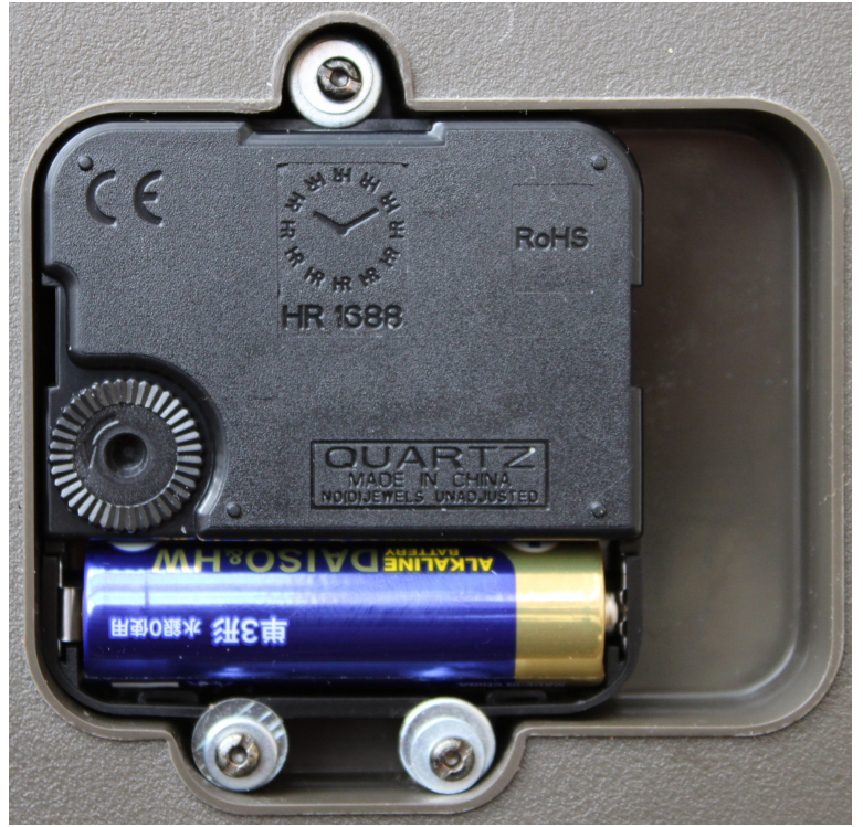
New clock core anchored by washers & original screws