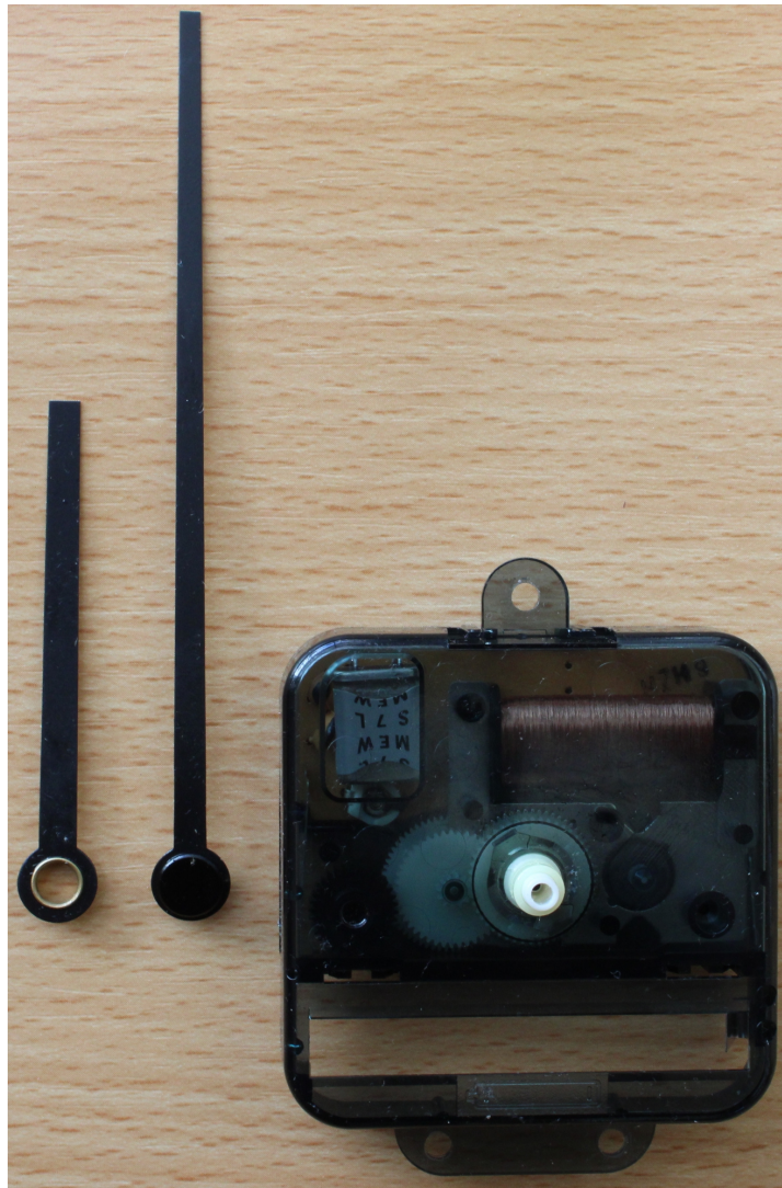
Original needles & clock core (Front) to be replaced