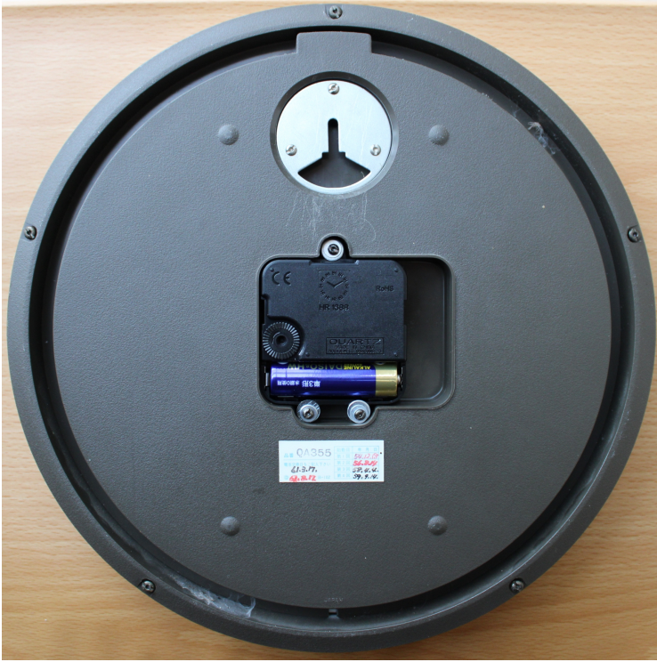
New clock core assembled