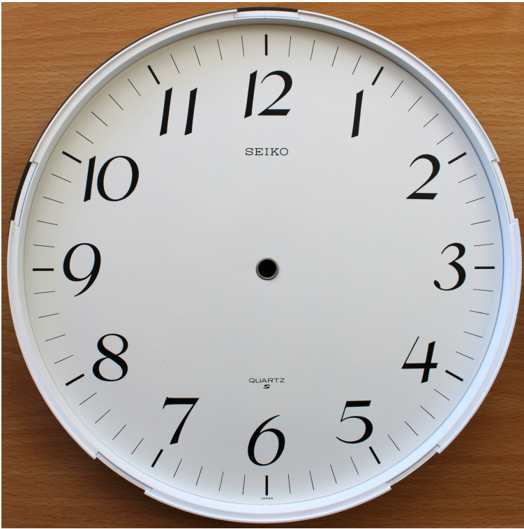
Original dial plate (Front)