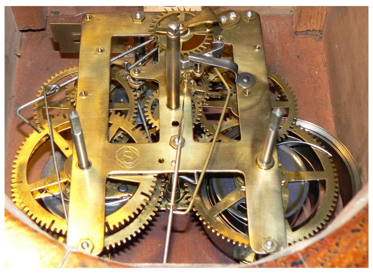
Clock Mechanism (Pawl Rod for Main Spiral Torsion Spring (Right) Broken, Pawl for Chime Spring (Left) Intact)