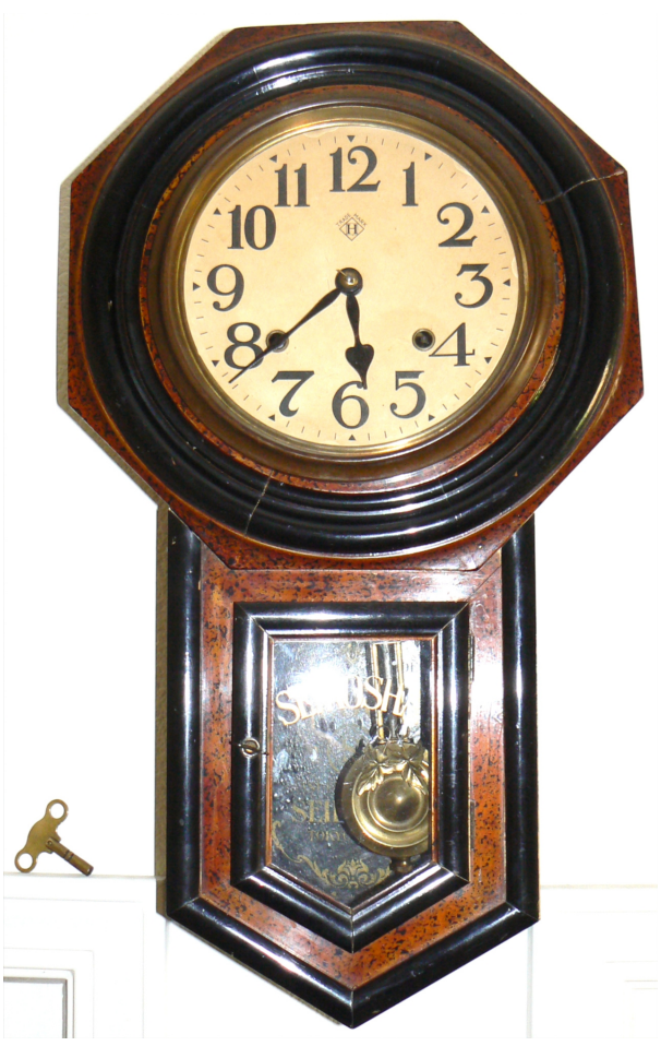
Pendulum Moving Left & Right