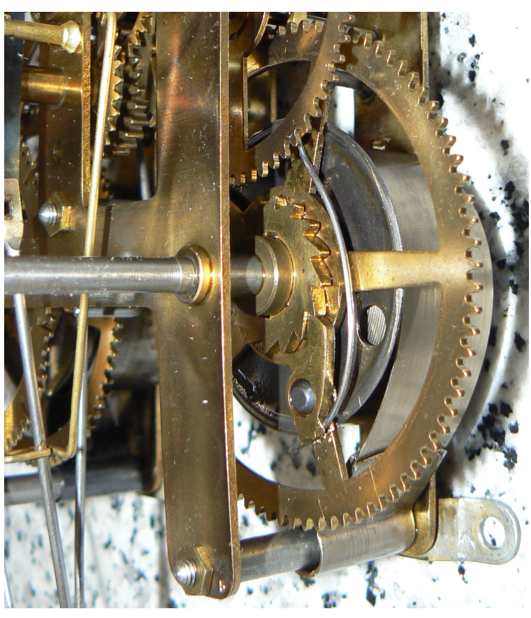
Assembled Back (Somewhat Short but Working Good)