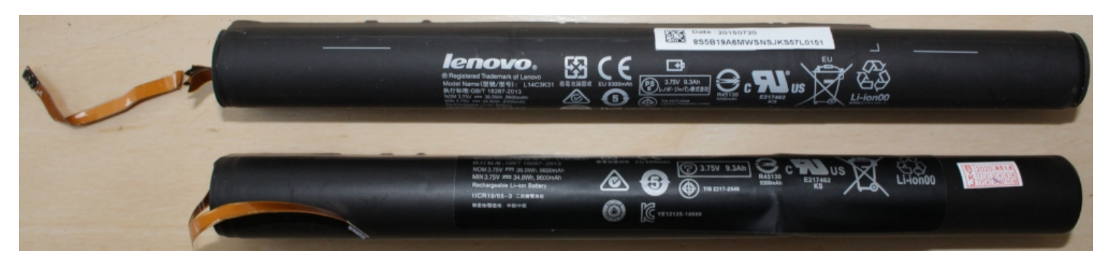
New (lower) & old (upper) battery pack