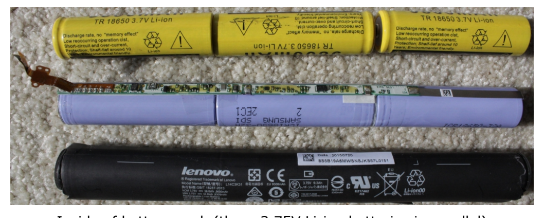
Inside of battery pack (three 3.75V Li-ion batteries in parallel)