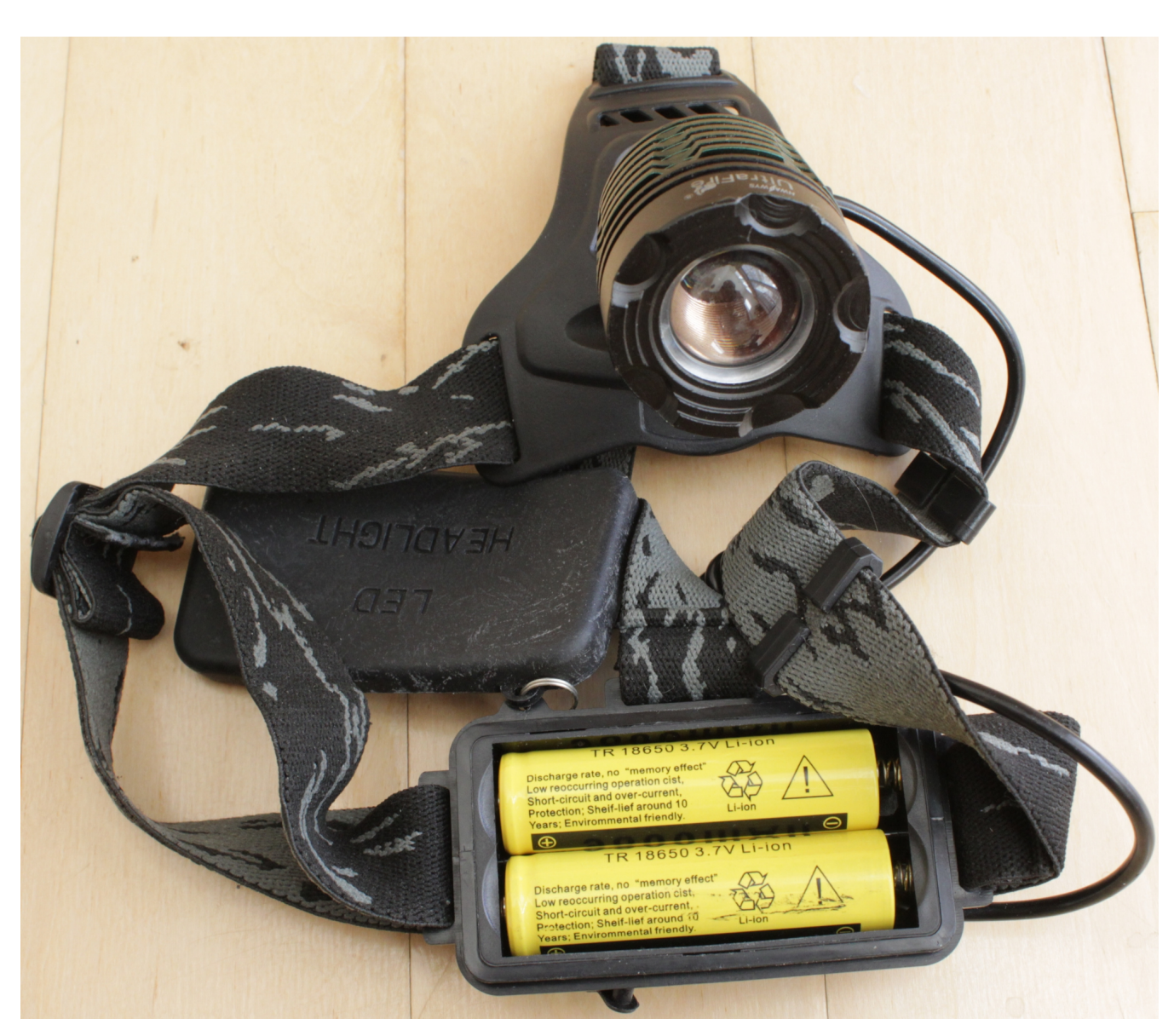
LED light using the same 3.7V Li-ion batteries