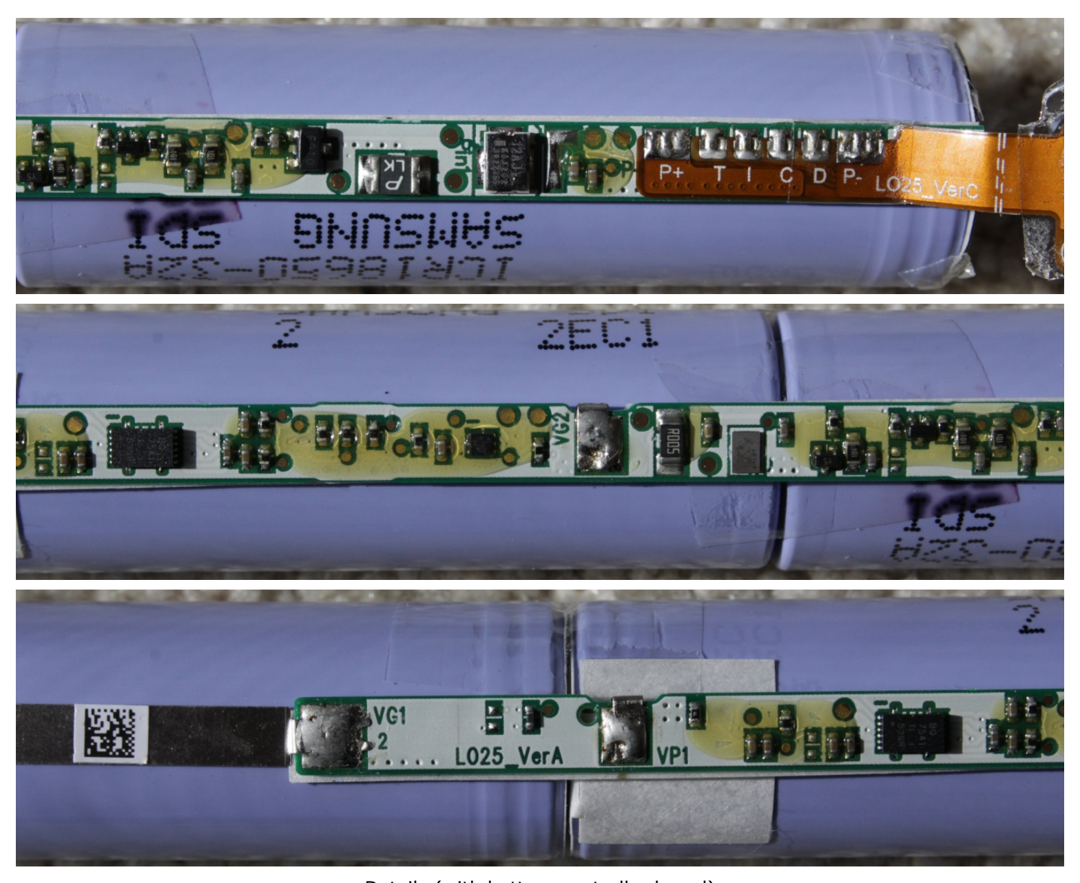
Details (with battery controller board)