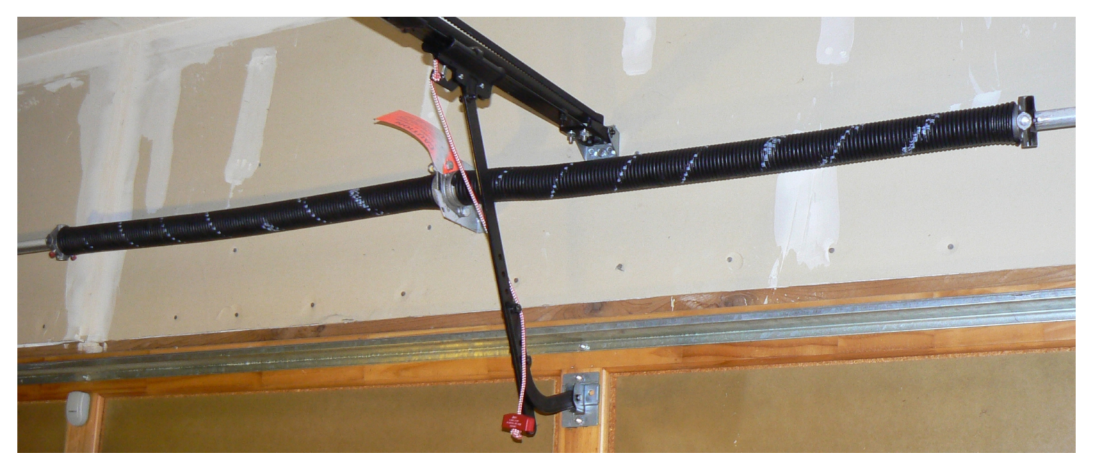
New Torsion Spring Mounted & Winded