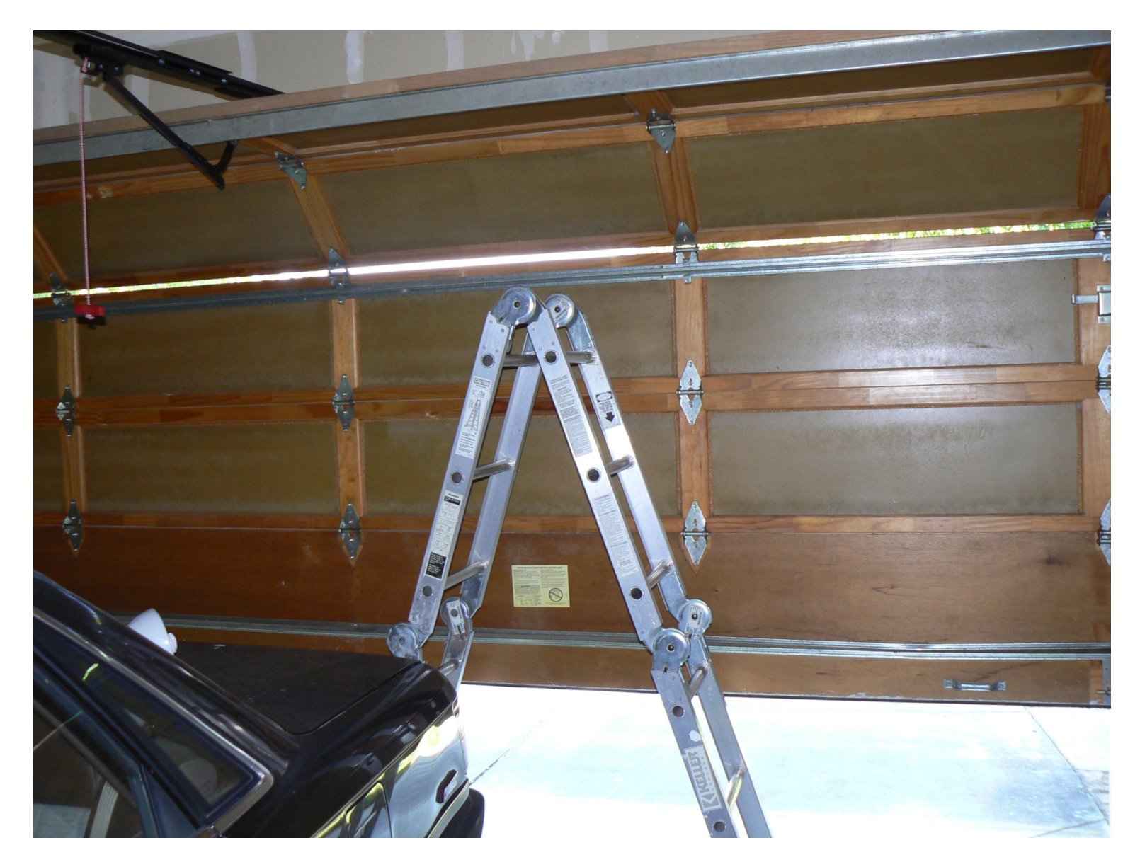
Garage door keeps opening steadily balancing heavy door weight (downward) & hoist energy (upward) generated by torsion spring. Garage door opener (Electric motor) generates smaller power to SHIFT the door up and down.