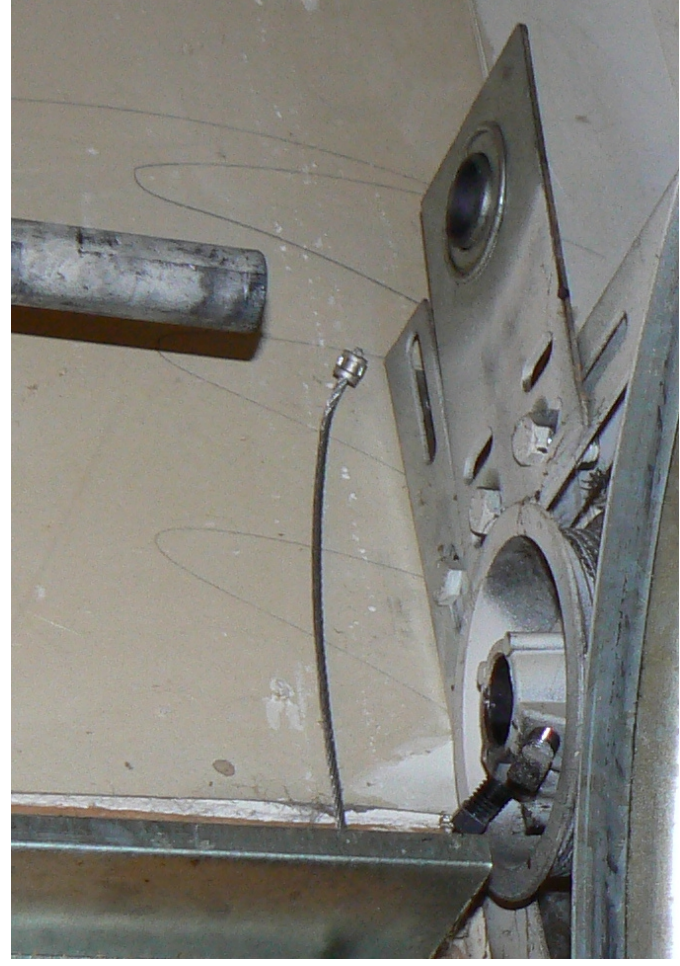
Unload & Load Spring Making Open Space here