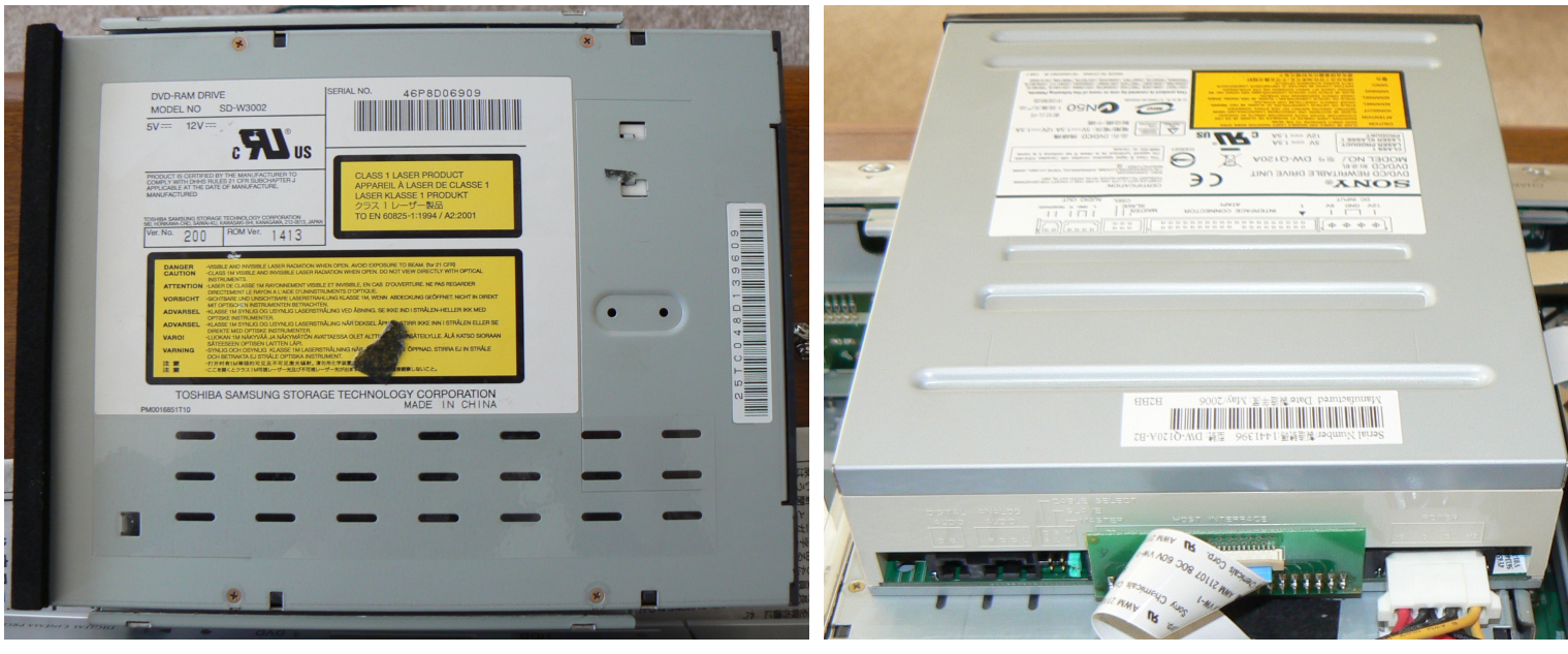
Broken DVD-RAM Drive (Toshiba Samsung)