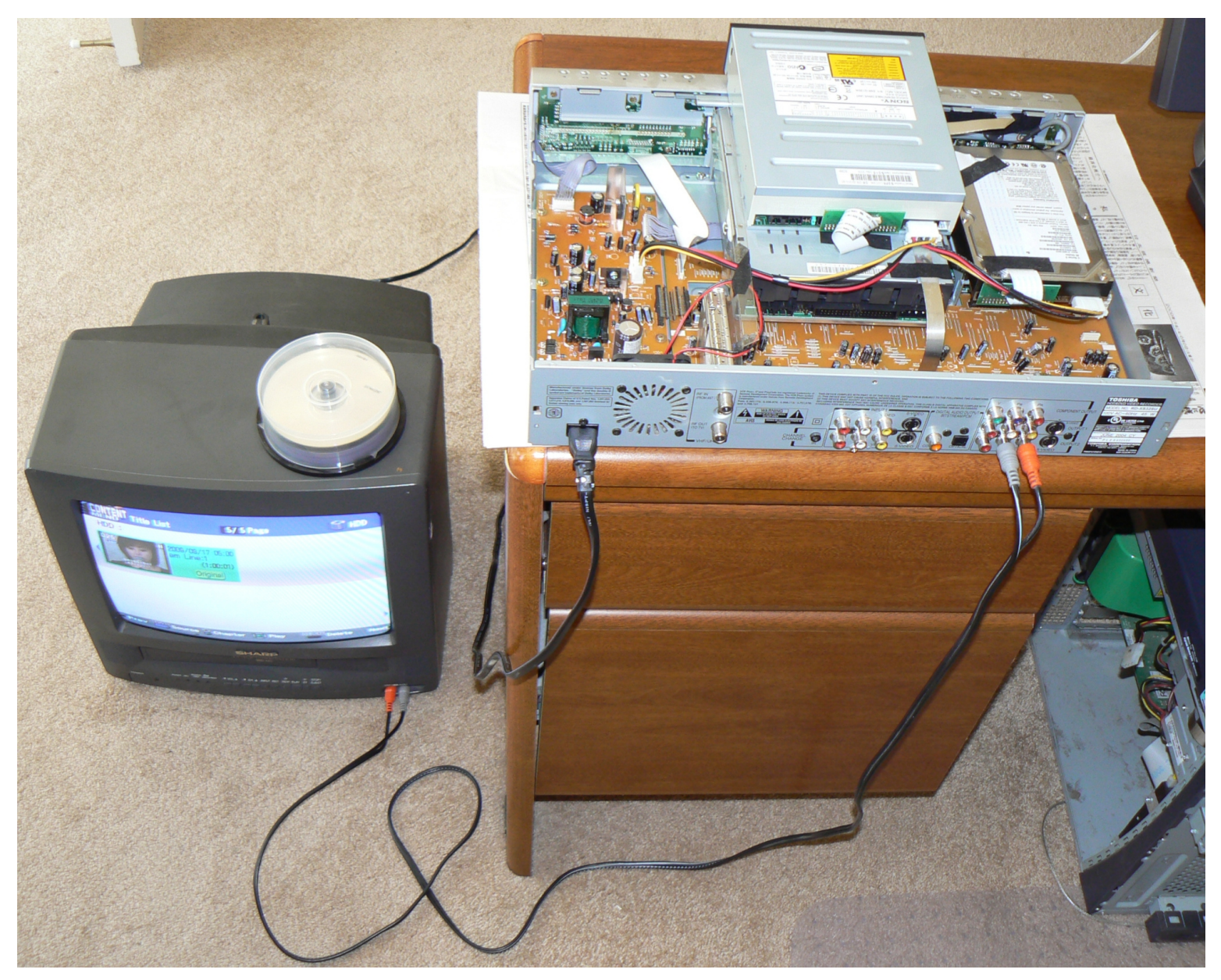
DVD-RW Drive with ATA Parallel Interface Piggy-backed, Analog TV Connected by Composite Video and Audio

The DVD-RAM/R/RW drive installed on Toshiba DVD recorder was a regular DVD drive with ATA (AT Attachement) parallel interface that was installed in IBM PCs.