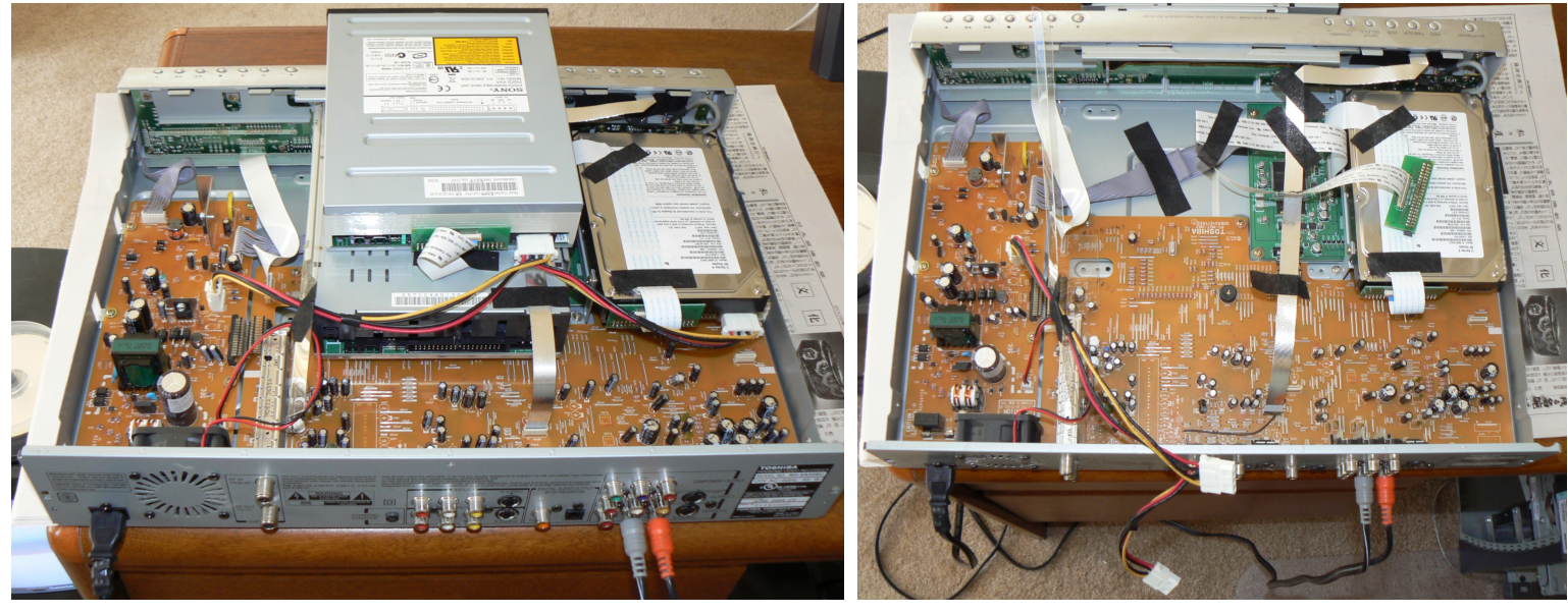
DVD Drive Piggy-backed (ATA Power & Data Connected)