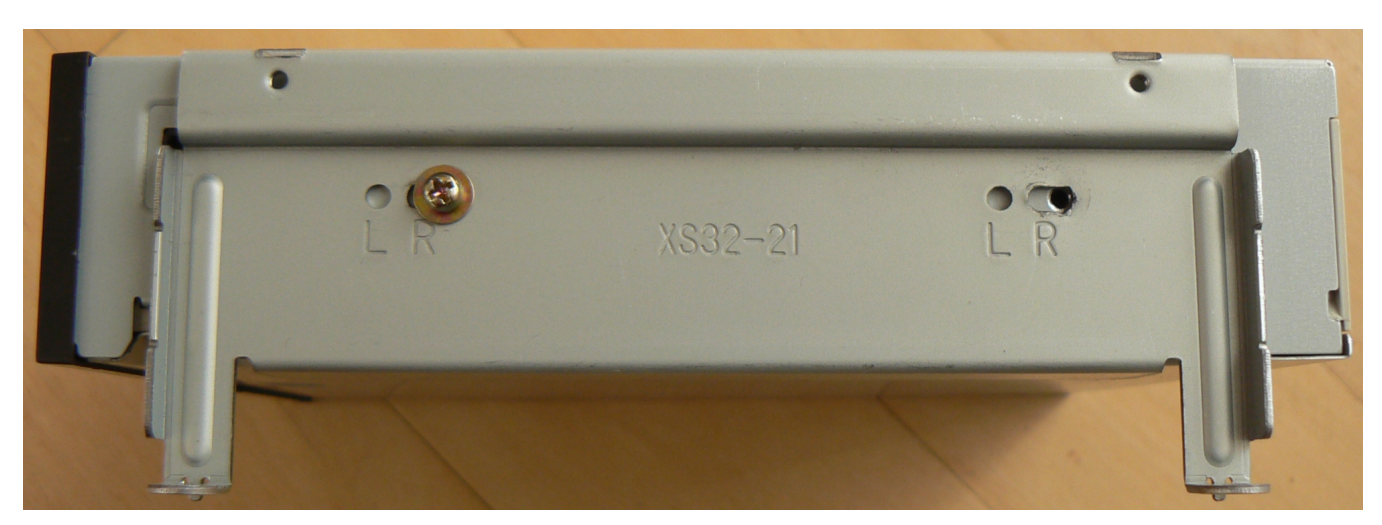
Bolt Hole Position of Side Bracket had to be Shifted Backward a bit