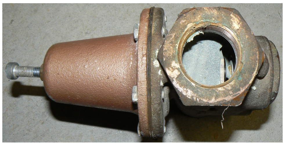
Scales Might Prevented Diaphragm Movement