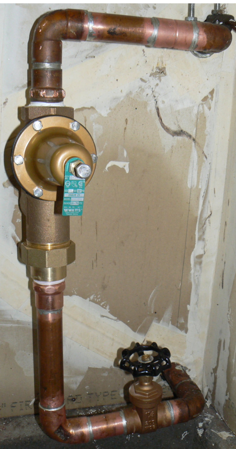
Old 1 1/4" Water Pressure Control & Main Valve