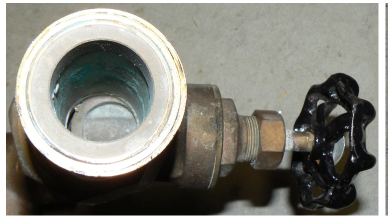
Scale/Sand Prevented Sliding Valve