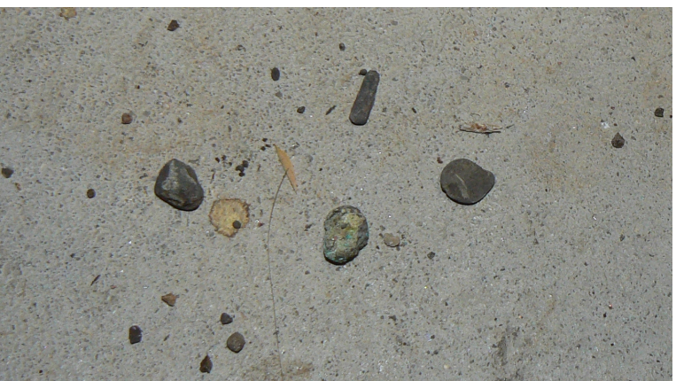
Pebbles & Sands Stored in Main Valve