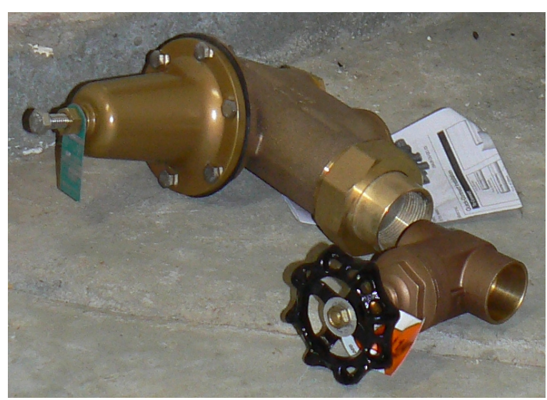
New 1 1/4" Water Pressure Control & Main Valve