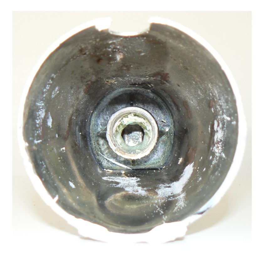
Sediments in Spout Clogs Tub/Shower Switch