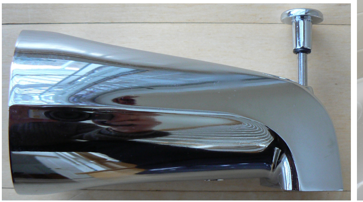
New Bath Tub Spout