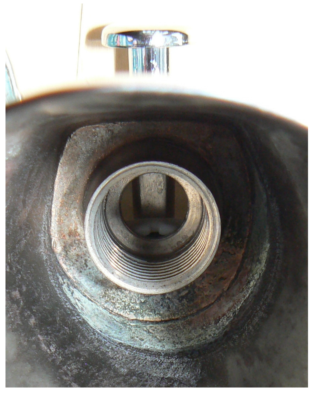
Water to Shower Head (Push down)