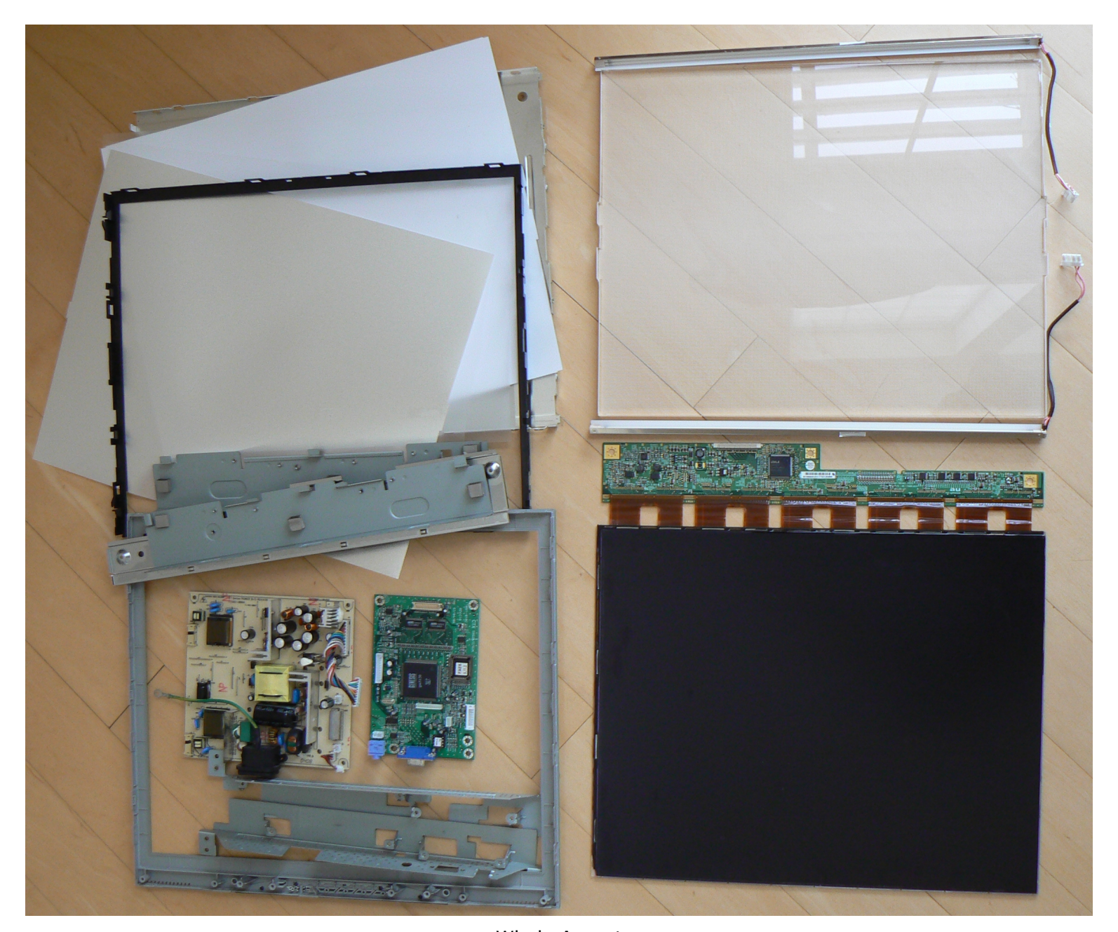
Whole Aspect Monitor Frame, Two Back Lights with Diffusion Sheet, Power Supply, Controller, Driver, LCD Flat Panel

Back light of LCD monitor was dead although other LCD flat panel, controller, row & column drivers, and power supply are all working.