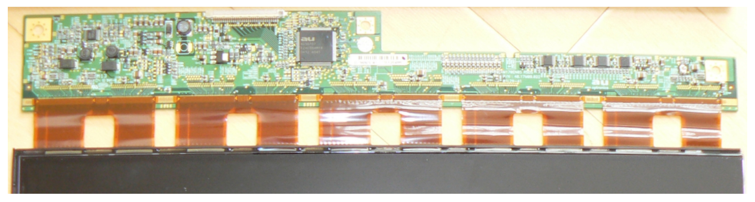
Row & Column Drivers and LCD Flat Panel Connected by FFC (Flexible Flat Cable)