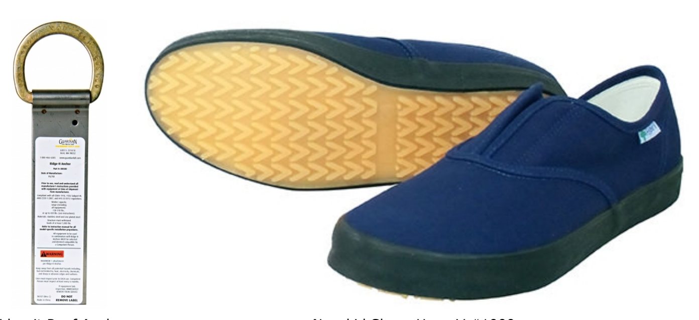
Ridge-it Roof Anchor