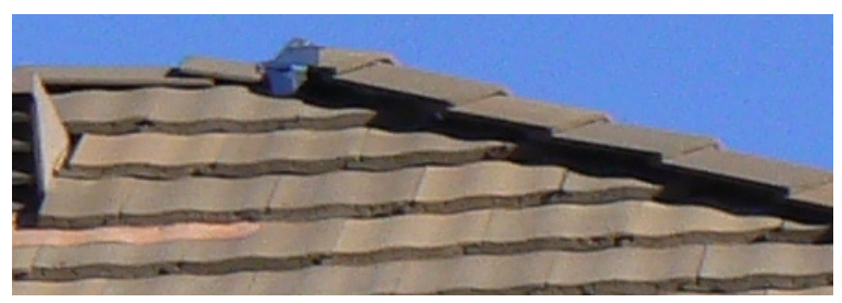
East Top - 2nd