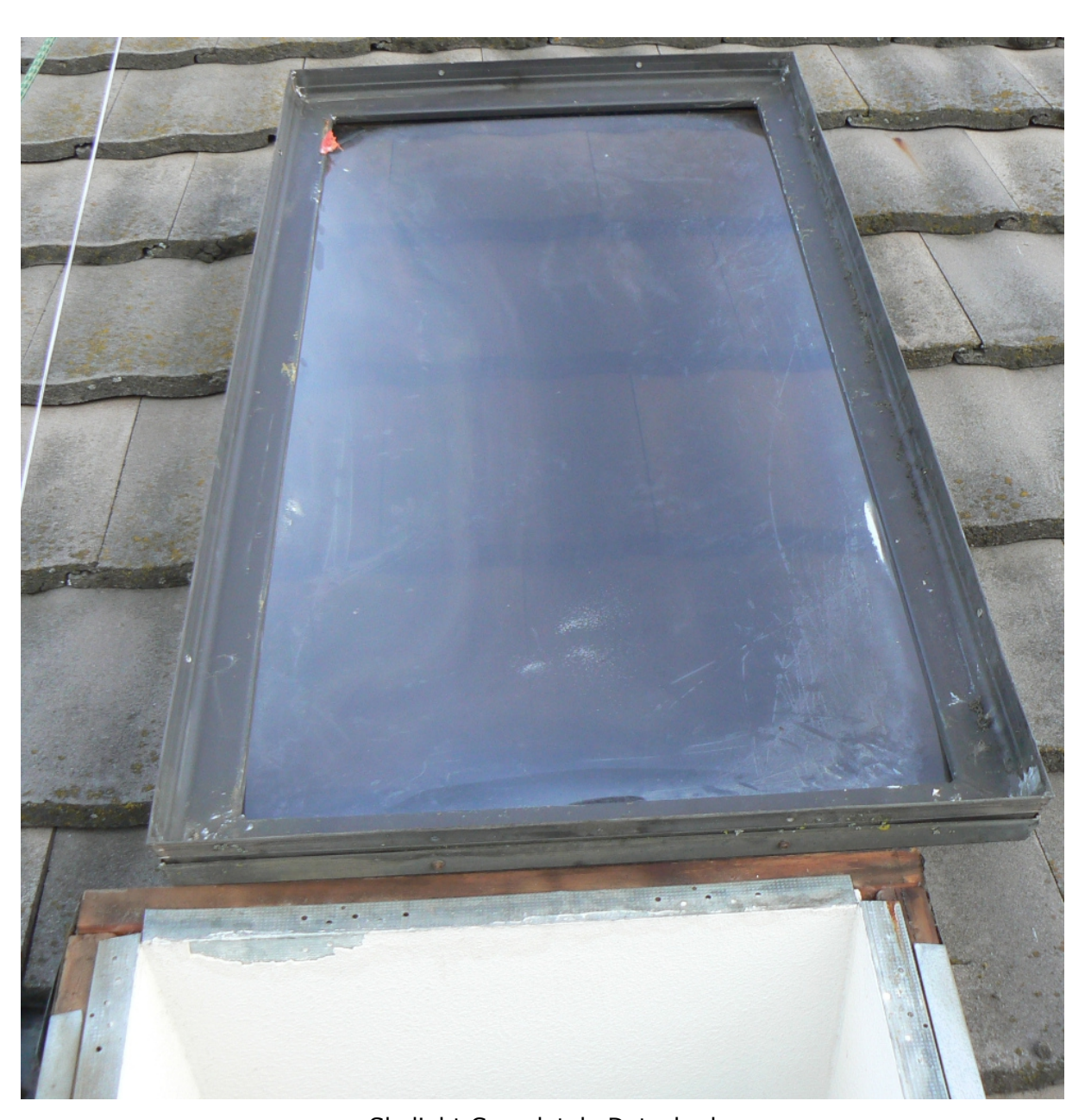
Skylight Completely Detached