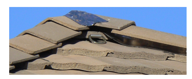
Burying Roof Anchor (East - 2nd)