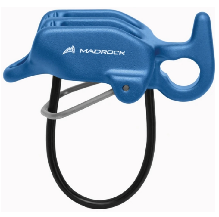
Mad Rock Aviator Belay Device