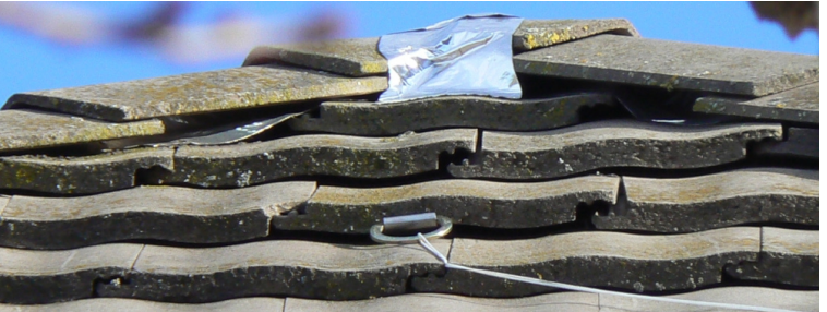
Burying Roof Anchor (West - 2nd)