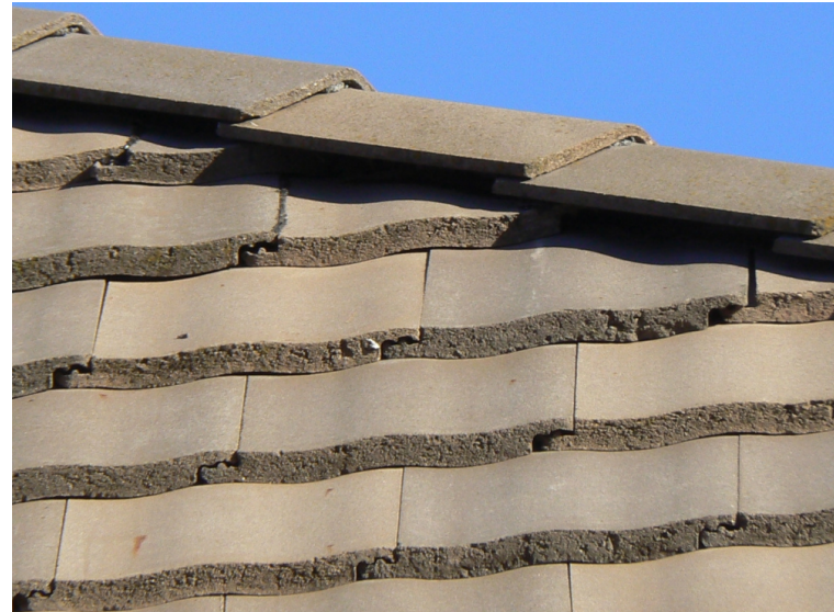
East Middle - 2nd