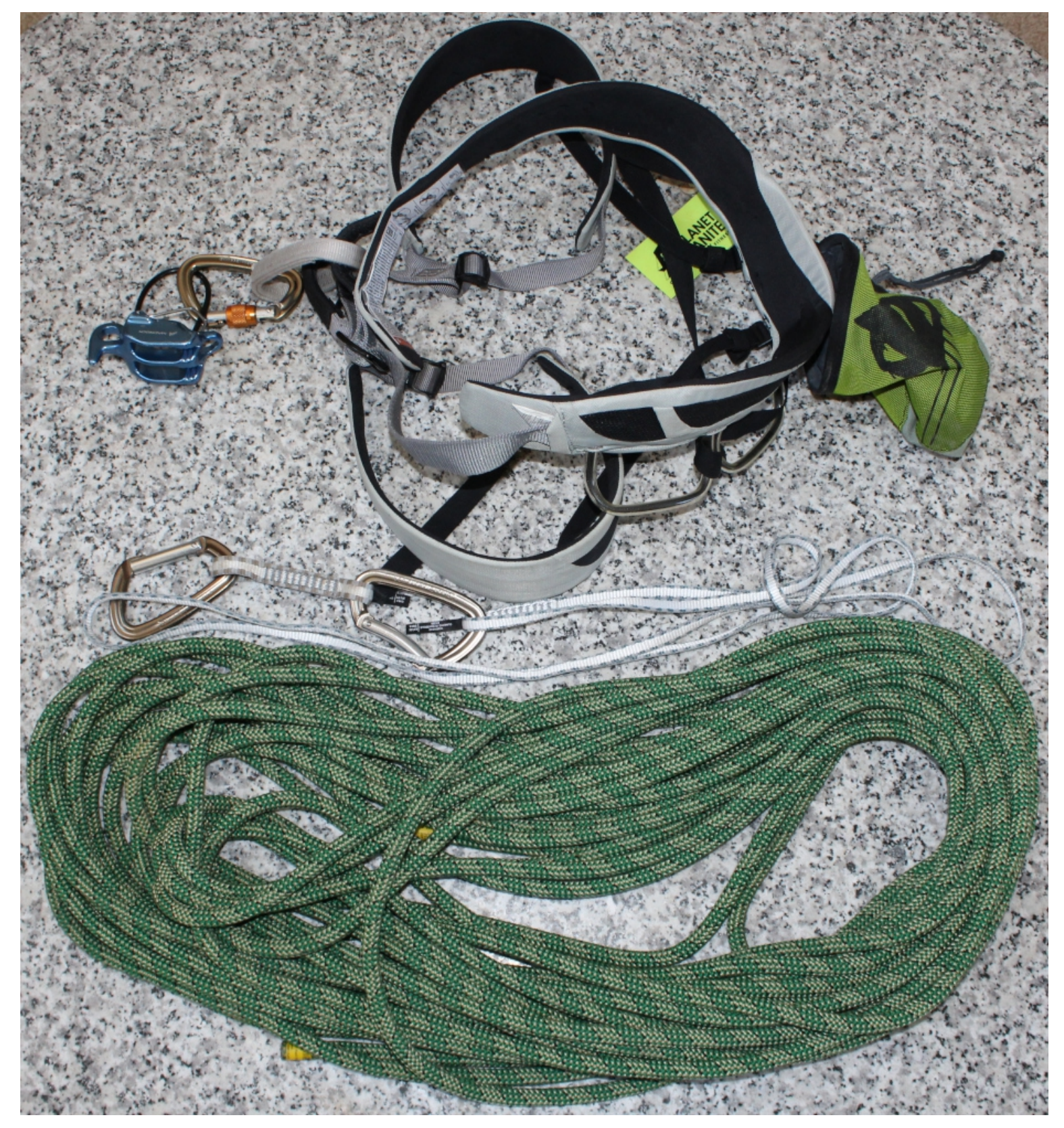
Complete Set of Roof Work Gear without Nonskid Shoes

The origin of the roof work gear I actually applied is the one for rock climbing, not the one dedicated for roof work.