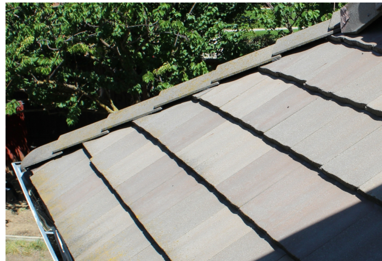
West - 1st