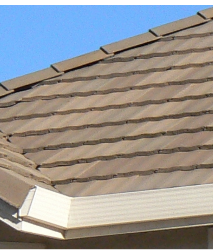
West Middle - 2nd