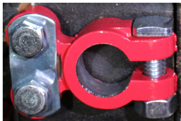
Good looking problematic battery terminal sold in market (Before filing off red paint on surface)