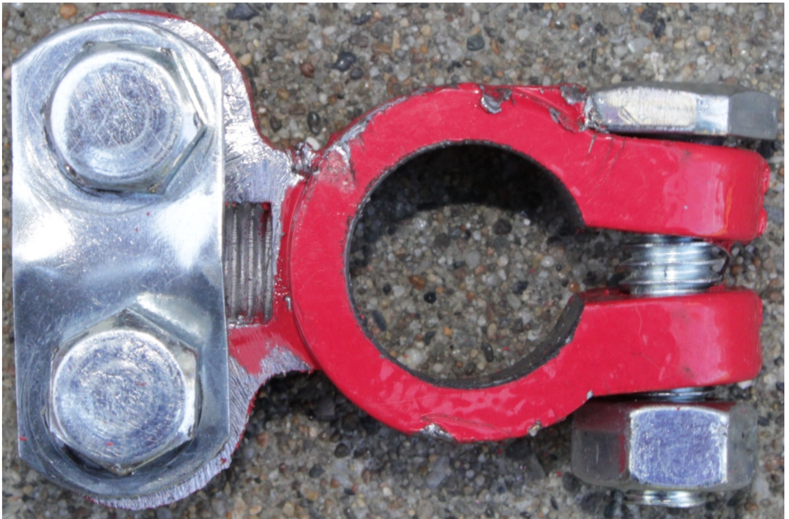
Ready to use (Negative black terminal also filed as it should be)