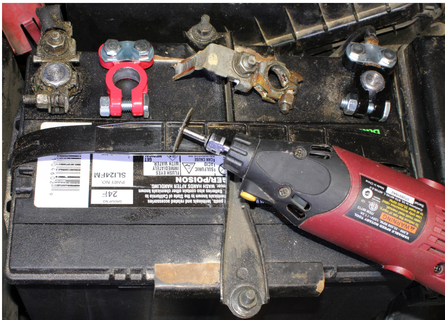
Negative battery terminal (right) replaced (Faulty insufficient contact without filing off black paint)