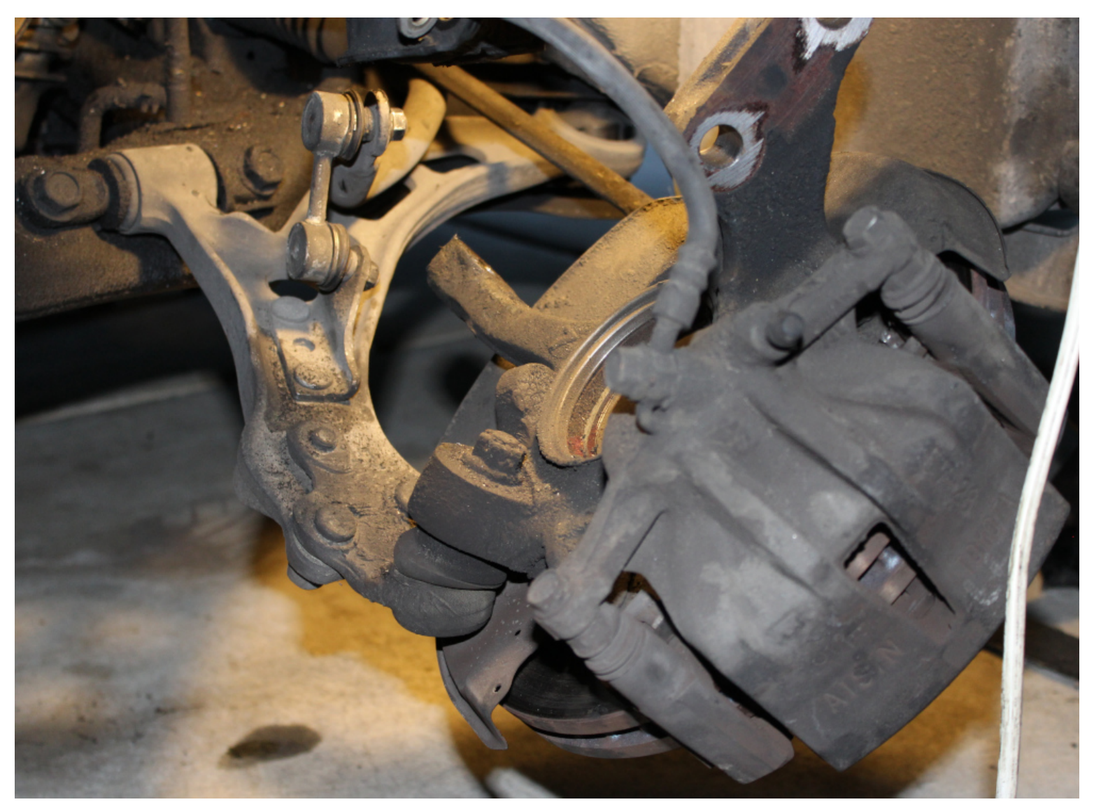
Stabilizer Link Set Bracket Replaced