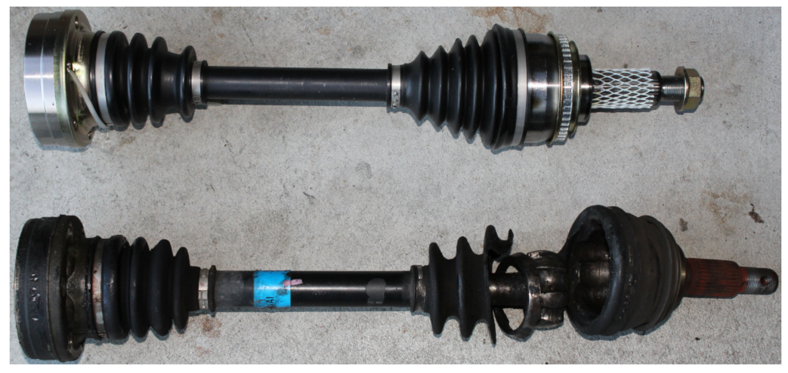
New Drive Axle with CV Joint (Top) & Old Drive Axle with Broken CV Joint (Bottom)

When CV (Constant Velocity) joint broke, stabilizer link set bracket broke at the same time. Six big and heavy metal balls in CV Joint fell down and scattered on the street.