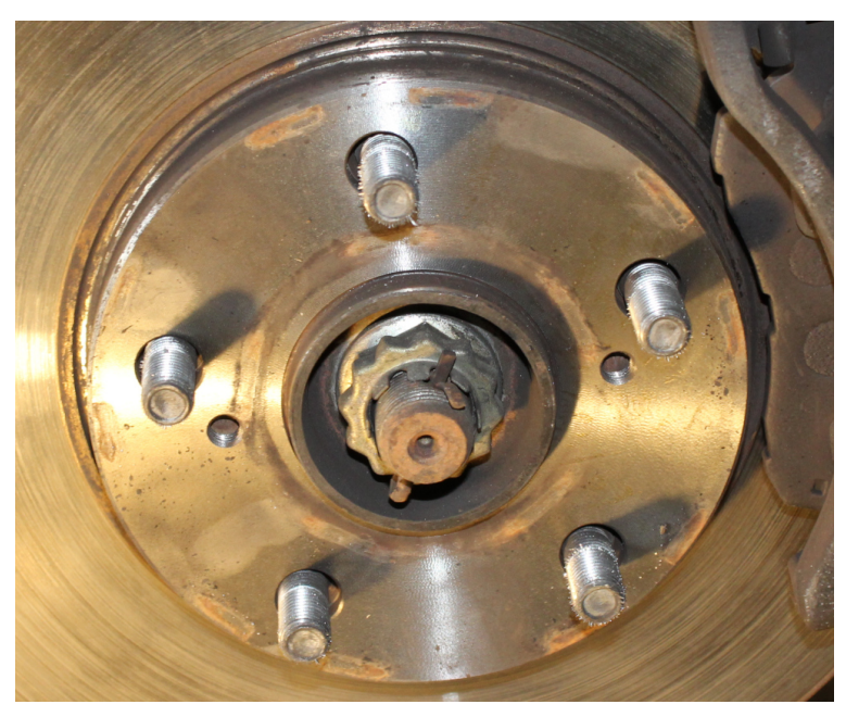
Drive Shaft Lock Nut (Center)