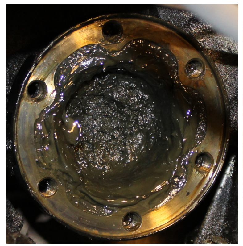
Inboard Joint Sub-Assembly