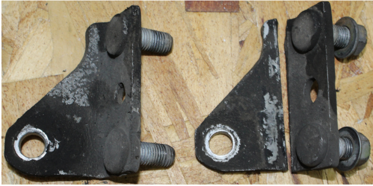
A working stabilizer link set bracket was taken out from old Camry at junk yard for free.