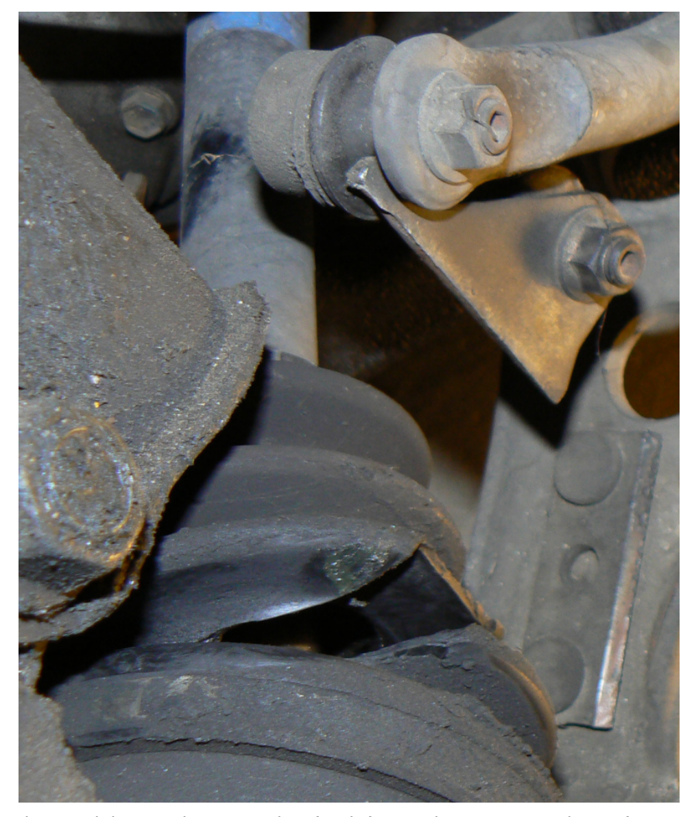
Broken Stabilizer Link Set Bracket (Right) & Broken CV Joint Sleeve (Bottom)