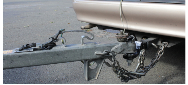
Both chains crossing and down through tow loop hole