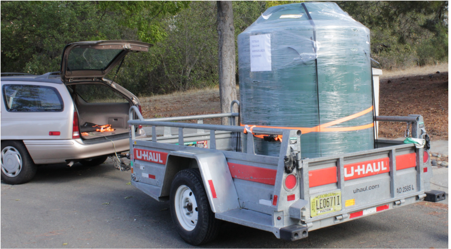
Uhaul 5' x 9' Utility Trailer loading a 300 gallon rain water tank