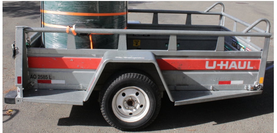
Side hook positions