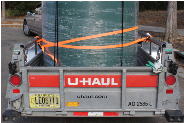
Rear (2 door latches)