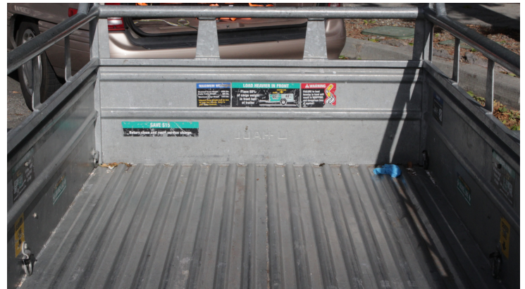
Hook positions on loading space