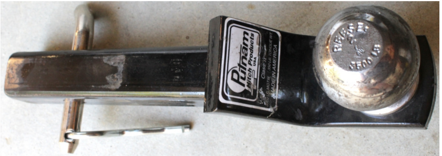
Trailer hitch with 2" hitch ball and attachments