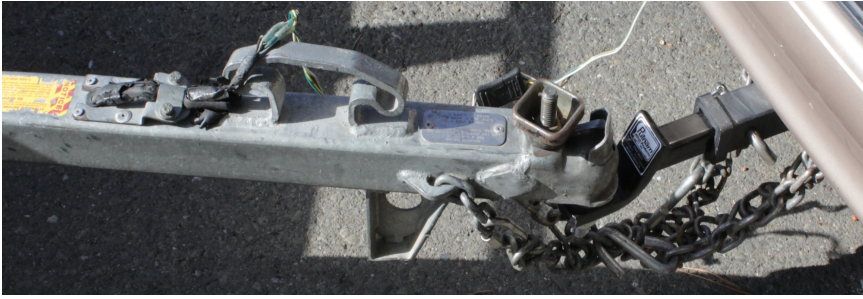
Hooking up trailer to vehicle (Hitch, Hitch ball, Chains, Electrical wiring)