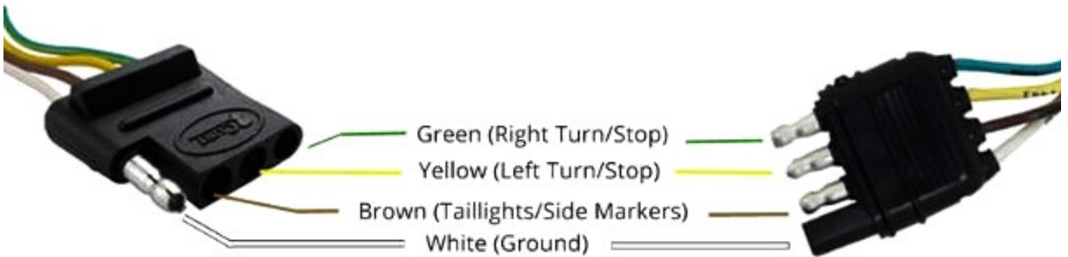
4-way flat wiring connector (Left: Vehicle side, Right: Trailer side)

Vehicle electrical wire connection schematic (O/LB, LG/O, R/LG, and ground go to 4-way flat connector below)