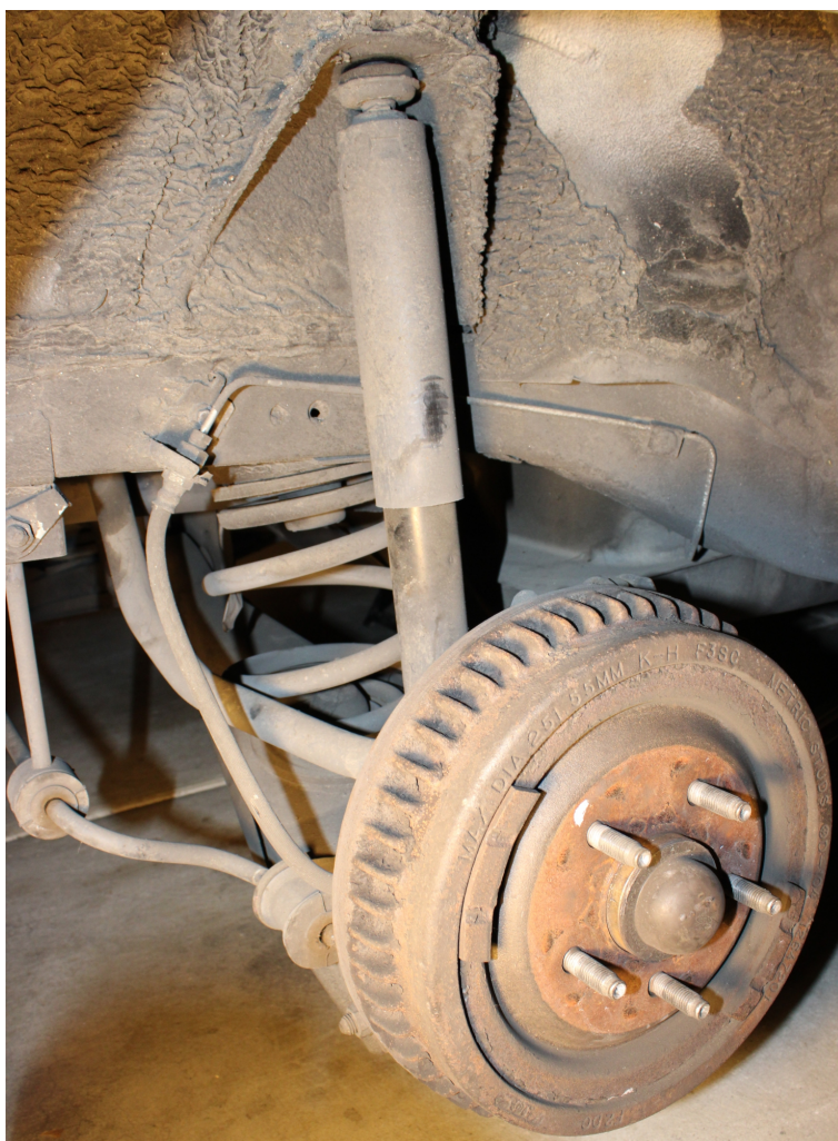
Coil spring & shock absorber independently assembled