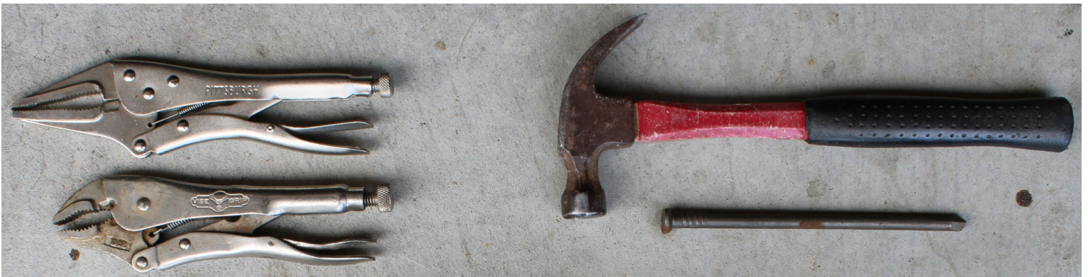
Locking pliers, a hammer and a big nail to tap down piston rod when removing old shock absorber