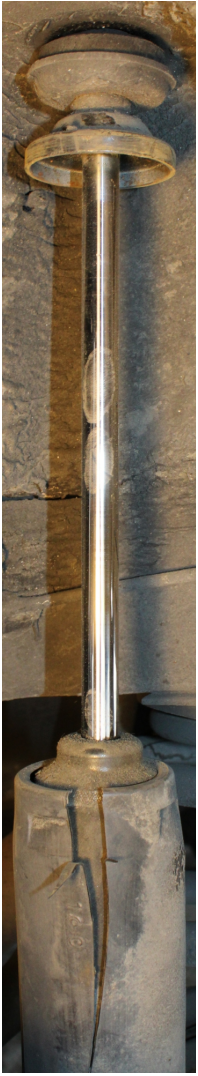
Cut out plastic sleeve