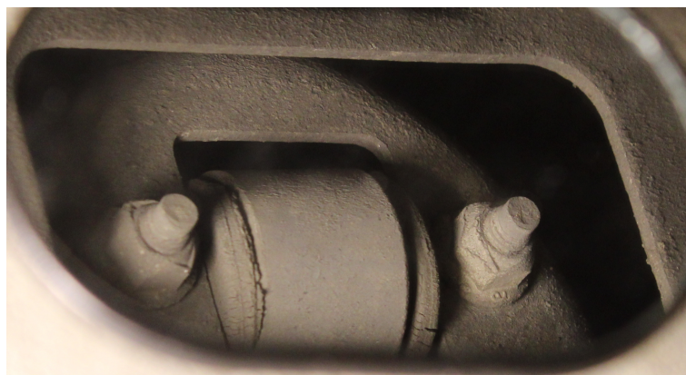
Assembly nuts at bottom