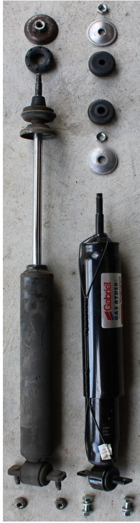
Old & New shock absorber (cut wire when assemble)