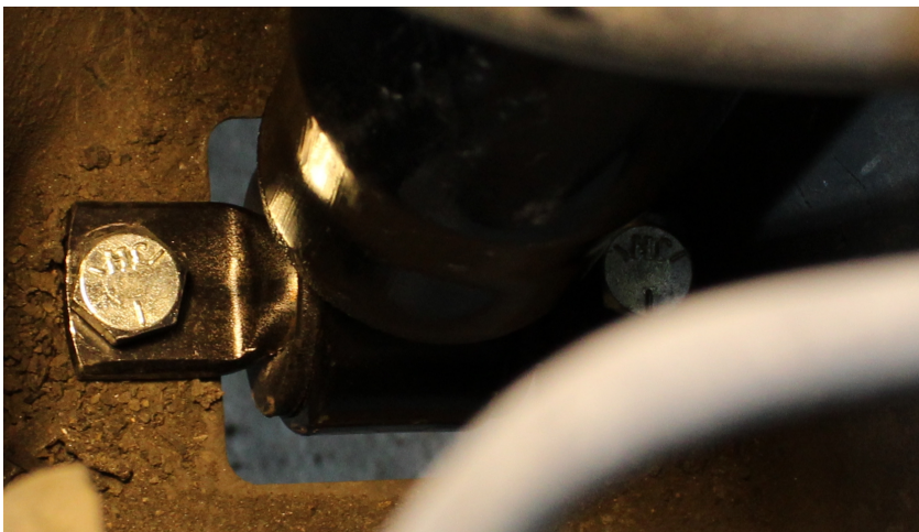
Lower assembly nuts & bolts done