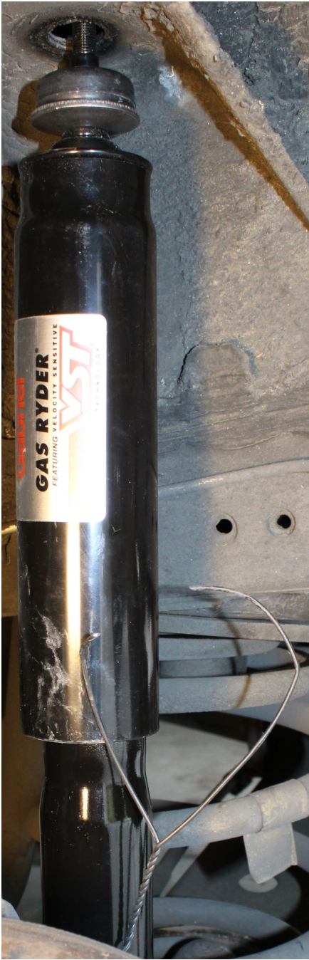
Cut wire and put rod into hole