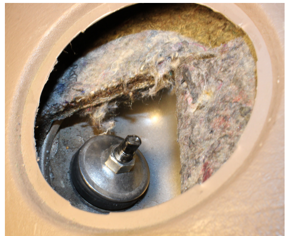
Upper assembly nut done