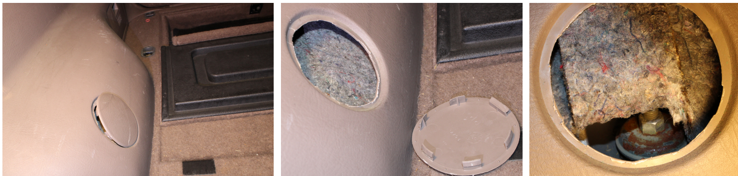
Shock absorber top nut access hole

In case of station wagon, shock absorber and coil spring are independently installed. Top nut access holes are made at huge trunk space and ease replacing shock absorbers a lot.