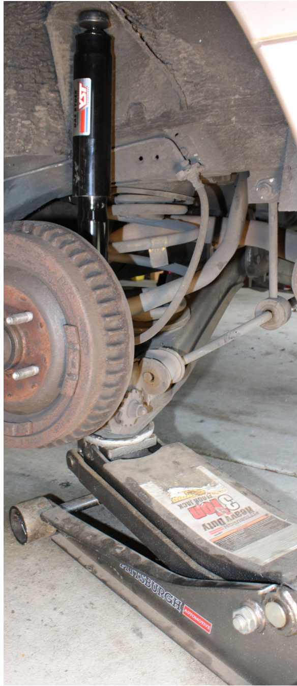
Adjusting piston rod height by floor jack