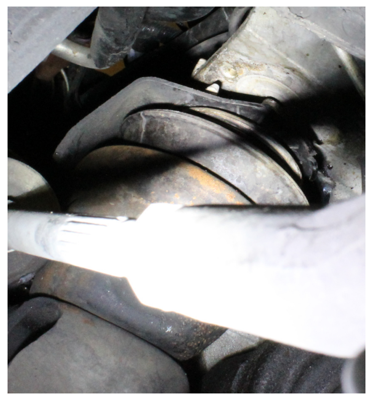
Top of the Engine Mount Released from Engine Chassis