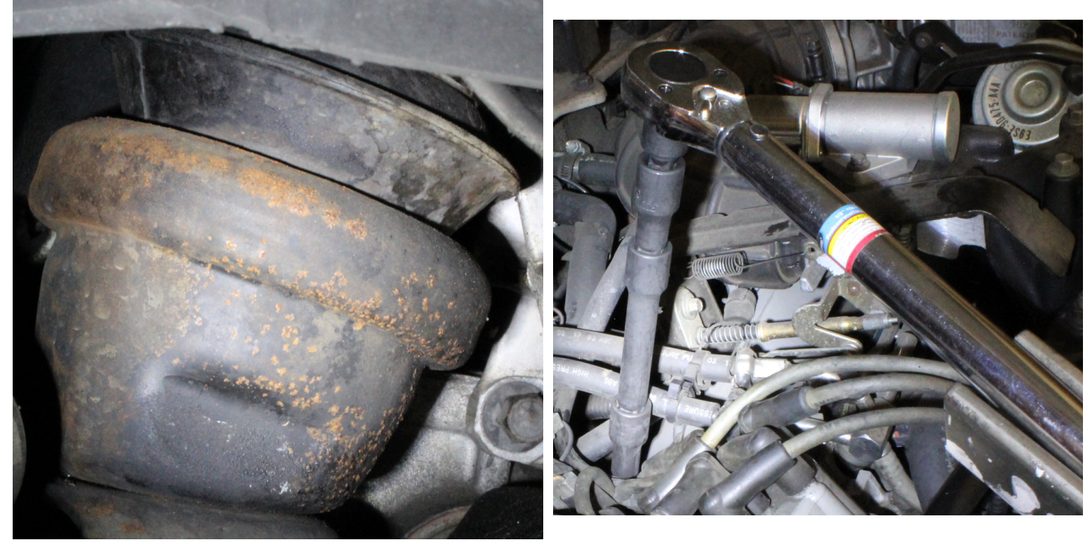
Old Engine Mount