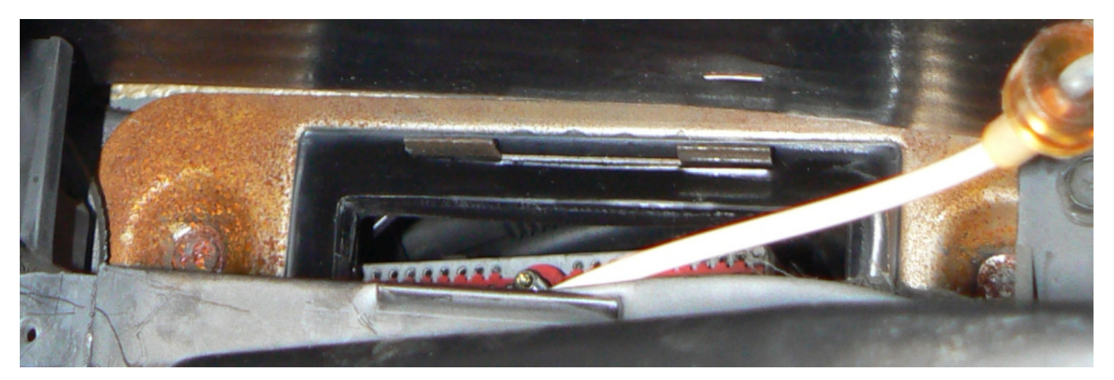
Old Engine Control Module Installed

OBDI scanner stopped the function occasionally because the serial data shift clock was not properly generated on ECM and provided to OBDI scanner.