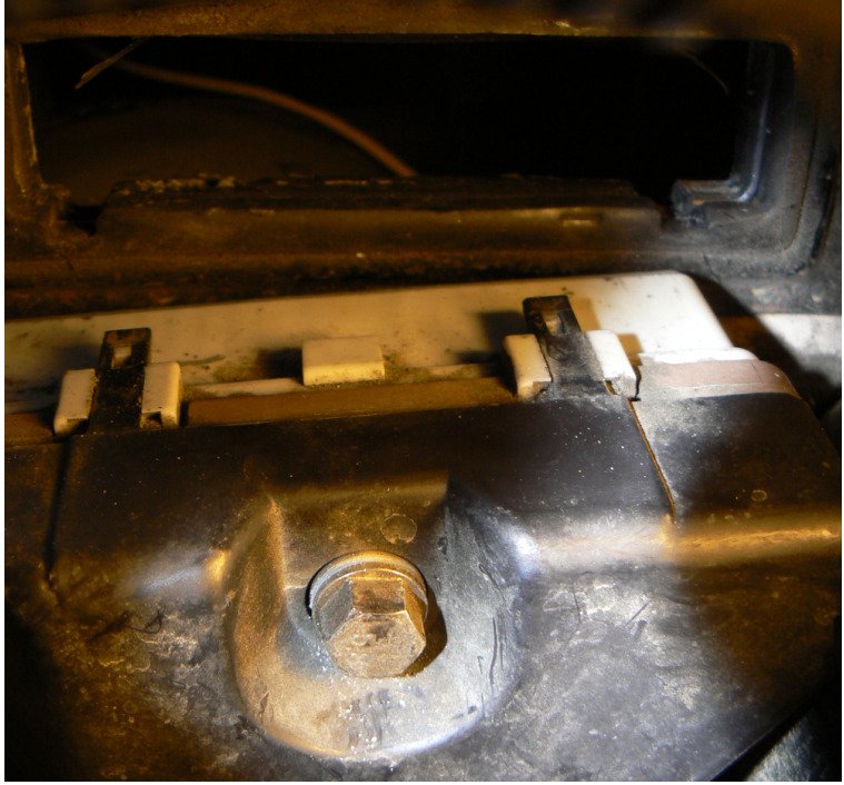
Rear (Left) & Front (Right; with Connector) Engine Control Module Bay