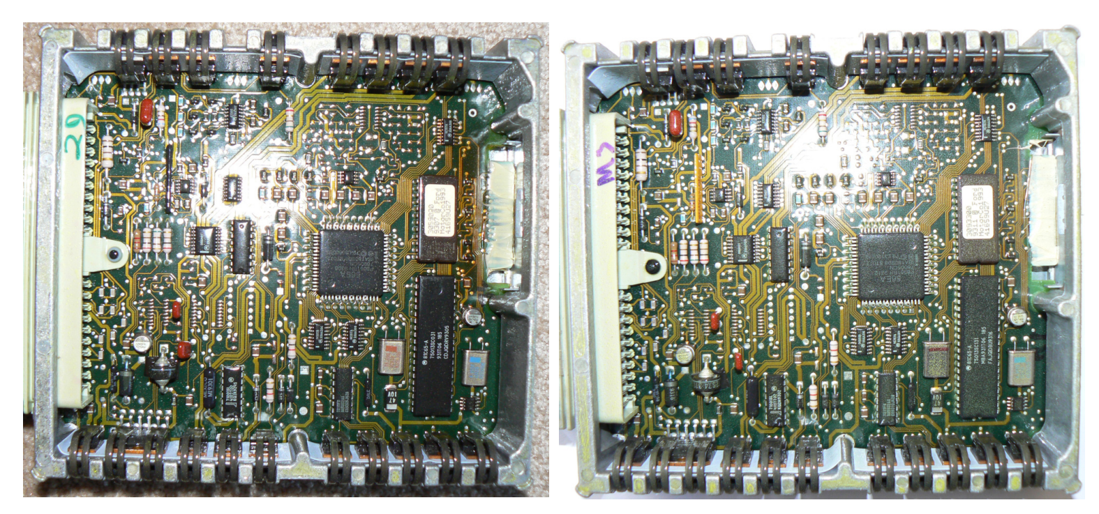
Old (Left) & New (Right) Engine Control Module (Parts Side)

After replacing ECM, all the problems were gone.