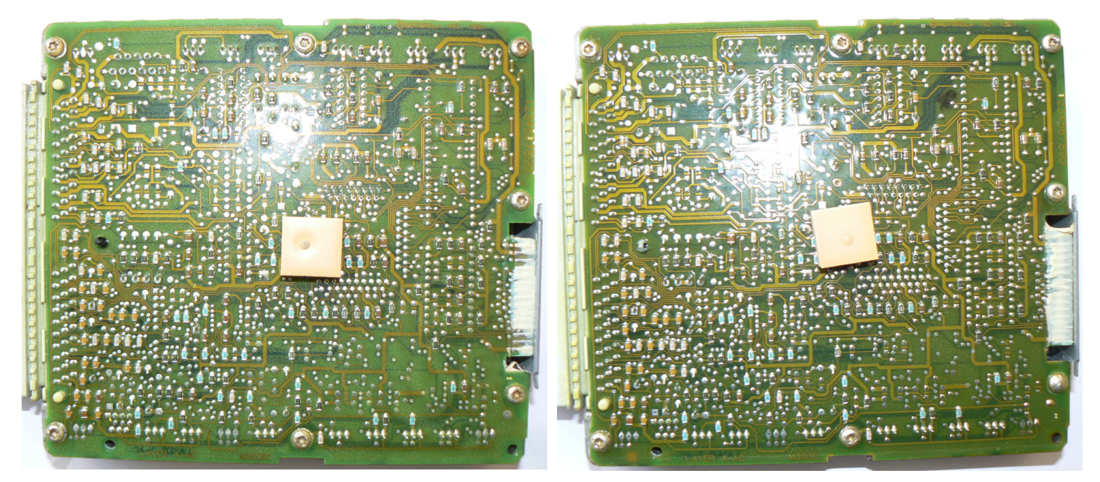
Old (Left) & New (Right) Engine Control Module (Interconnect Side)