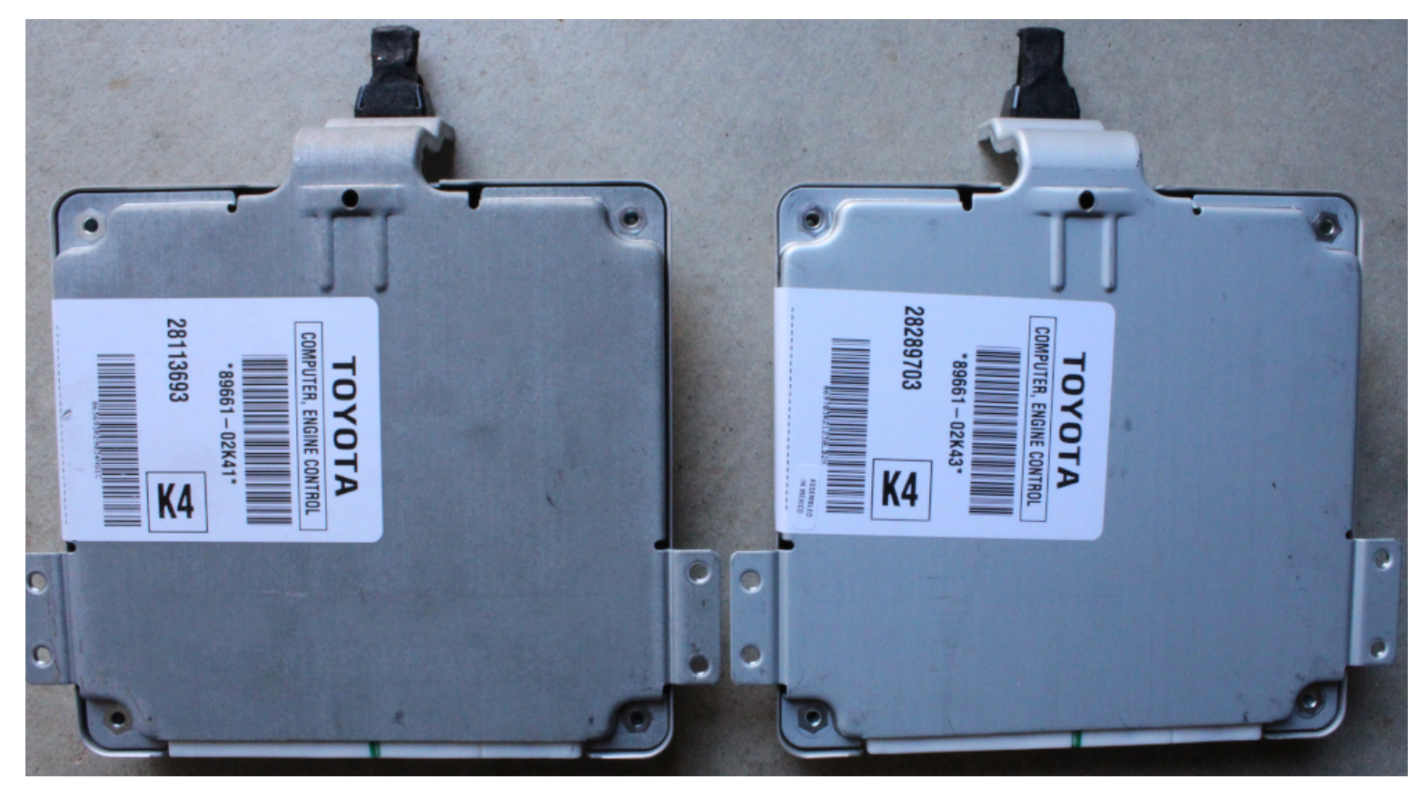
Old ECU & New ECU

Regularly, VIN (Vehicle Identification Number) is not stored on a new ECU.