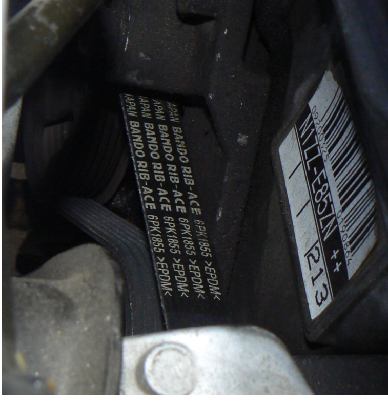
New Drive Belt Wound