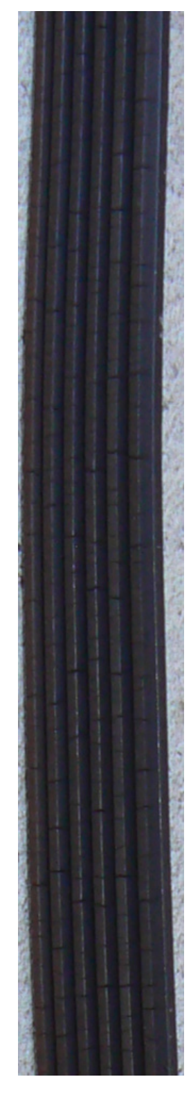
Cracked Drive Belt

Old drive belt exhibited a lot of cracks due to deterioration. The situation was under fracture, nearly break down.